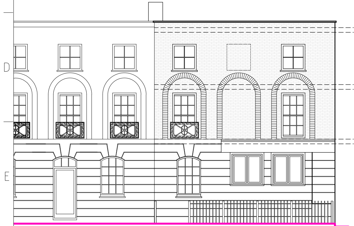
EVERSHOLT STREET ELEVATION