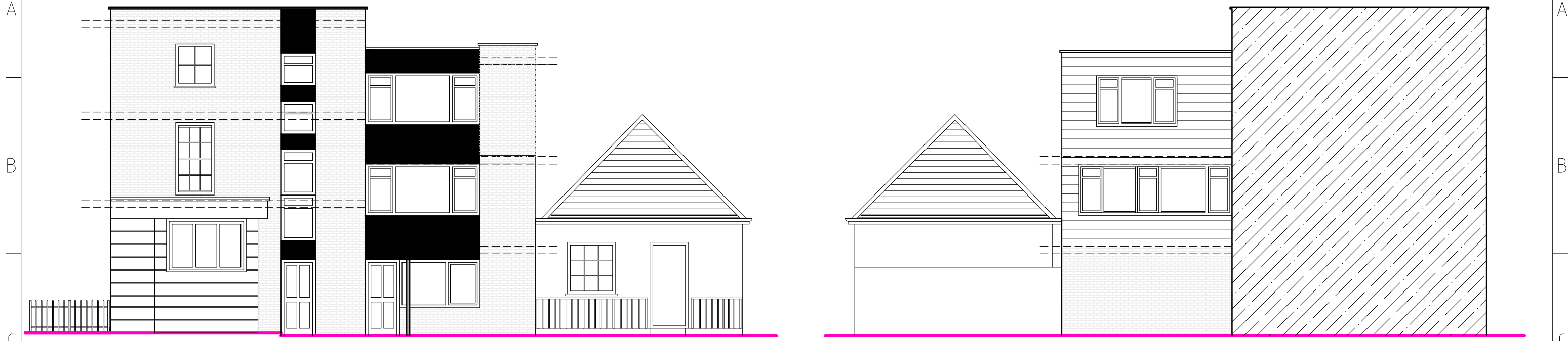
ALDENHAM STREET ELEVATION