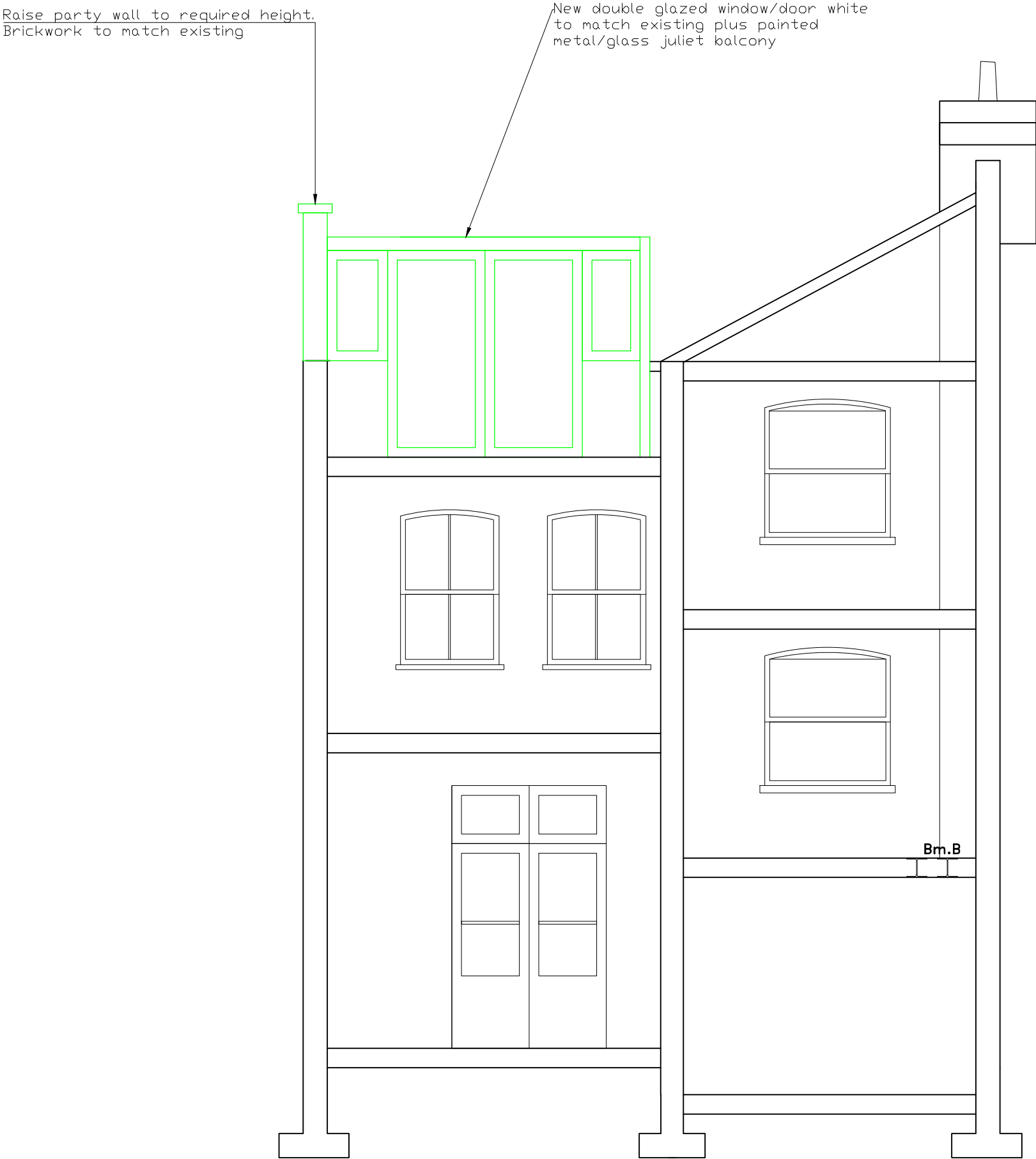
PROPOSED SECTION D-D

ISSUED FOR LOCAL AUTHORITY PLANNING APPROVAL