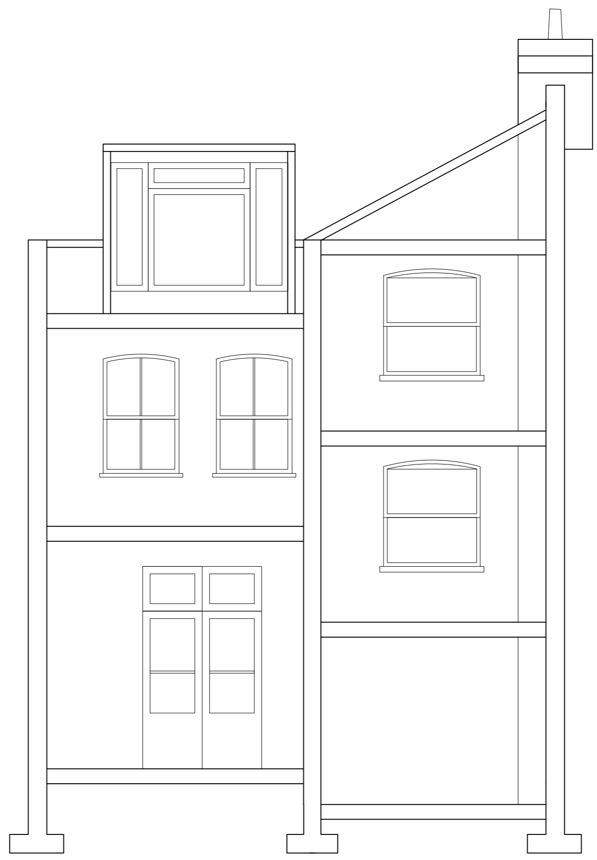
EXISTING SECTION D-D

ISSUED FOR LOCAL AUTHORITY PLANNING APPROVAL