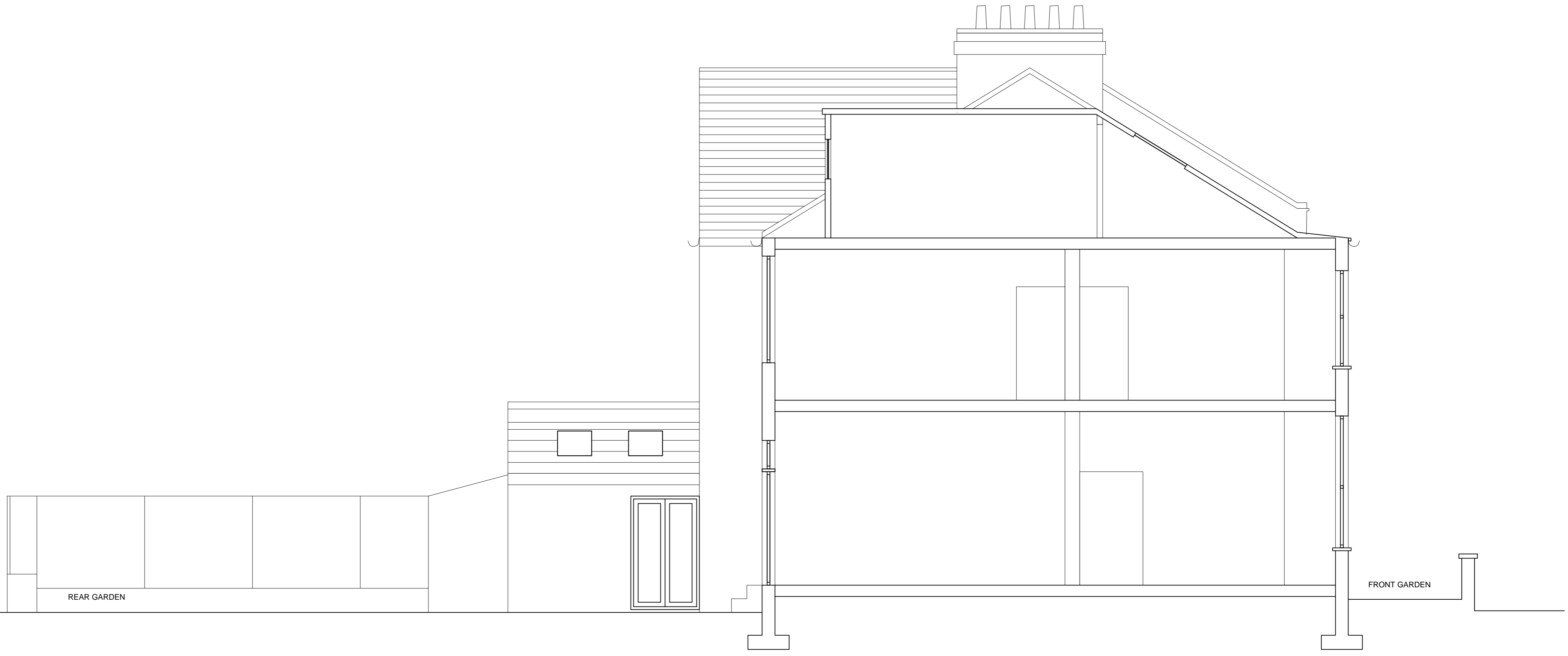
EXISTING SECTION A-A

NOTES: DO NOT SCALE THIS DRAWING FIGURED DIMENSIONS ONLY TO BE WORKED TO. REPORT ANY DISCREPANCIES TO STARK ASSOCIATES PRIOR TO COMMENCEMENT ON SITE THIS DRAWING TO BE READ IN CONJUNCTION WITH DRAWINGS