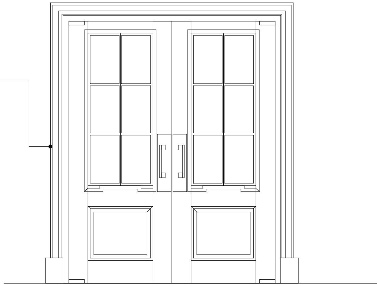
ELEVATION: REPLACEMENT ENTRANCE DOORS TO SOUTH PART THIRD FLOOR UNIT. 1:20

SOUTH SIDE existing perimeter trunking to be replaced with new. Stained OAK frame, door and surround to match in profile and detail entrance doors to NORTH SIDE. Doors to fit within existing opening.