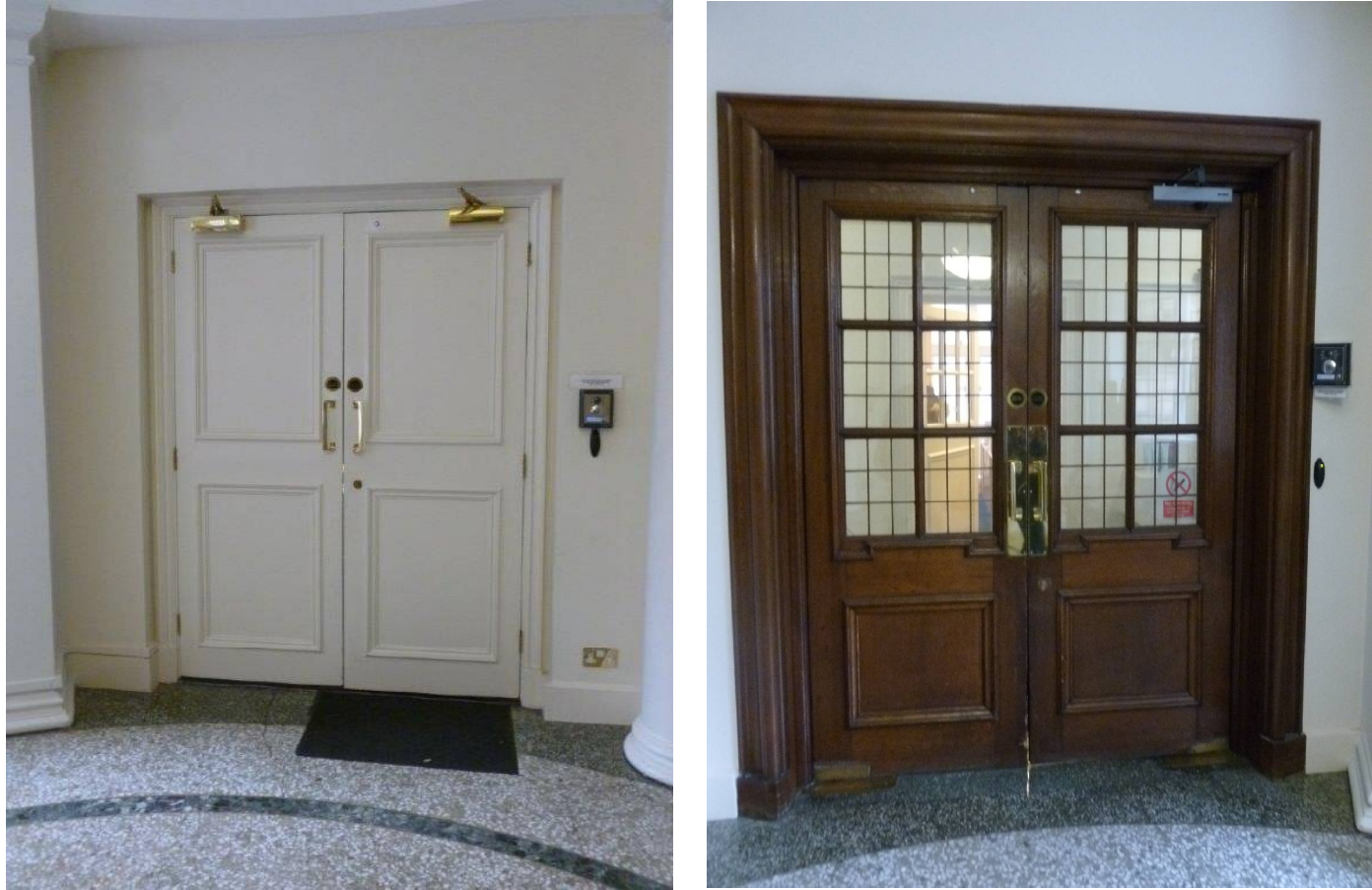
Existing third floor entrance doors south side