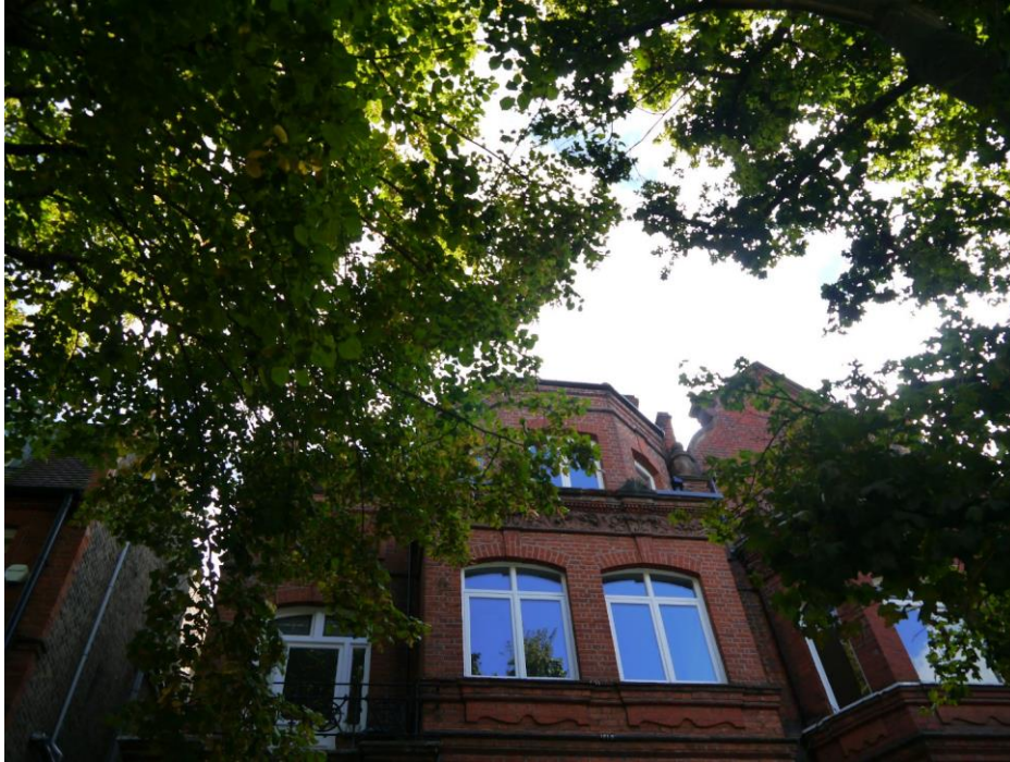
Figure 9 - View from 103 Greencroft Gardens

Visibility of the mock up was not possible on the south side of Greencroft Gardens from 103 moving upwards in the addresses as the street moves west, and from 99 Greencroft Gardens moving east. This was due to the position of the building and the inset of the terrace, though there is also extensive tree coverage.