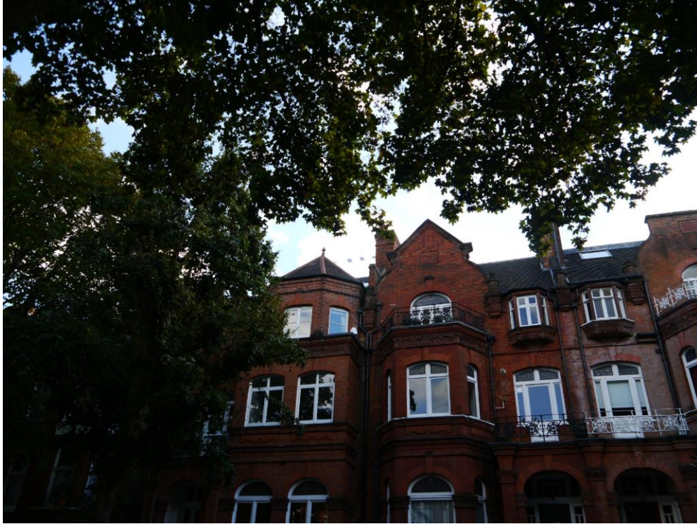
Figure 3 - View from 120 Greencroft Gardens