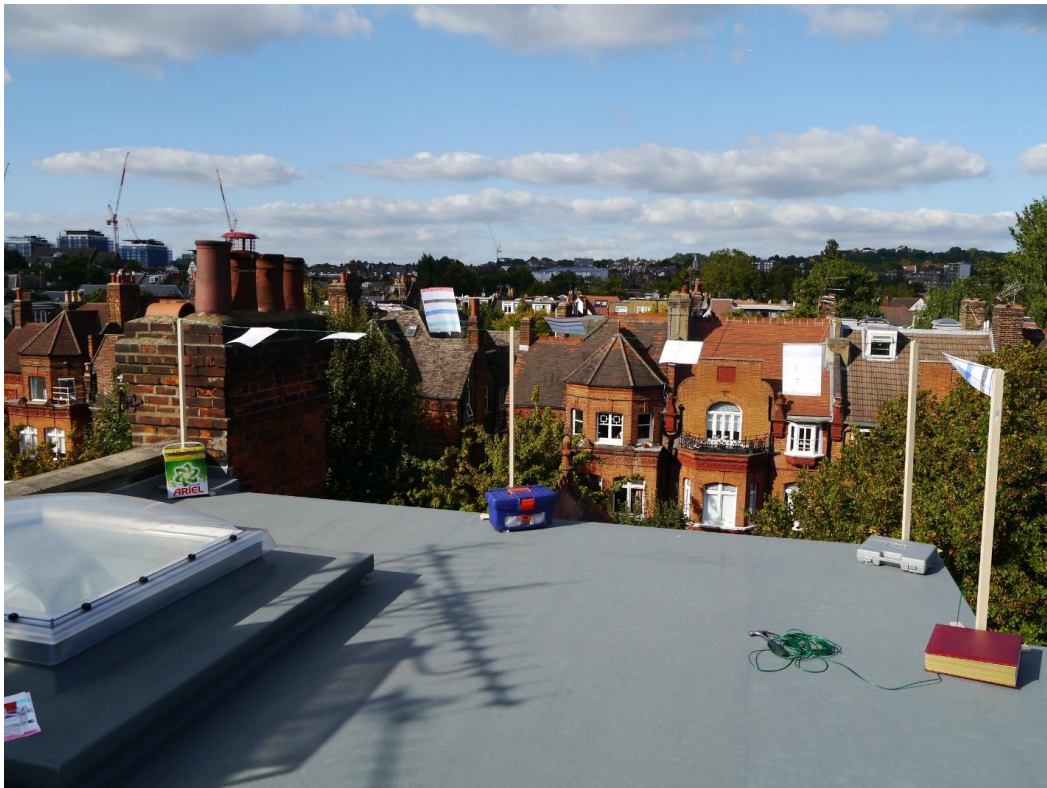
Figure 1- Mock Up view from roof

In order to show the level of visibility from the street I constructed some wood stands of 124cm height to simulate the height of the balustrades that will be mounted if our terrace is granted permission. I placed the upstands approximately 10 cm from the edge of the roof to show anticipated installation area. Between the wood stands I strung a green washing line at a height of 124cm and hung A4 sheets of paper with approximately 50cm between each sheet. To highlight the paper against the sky and clouds they were coloured with 2cm horizontal stripes of green, blue, black and red.