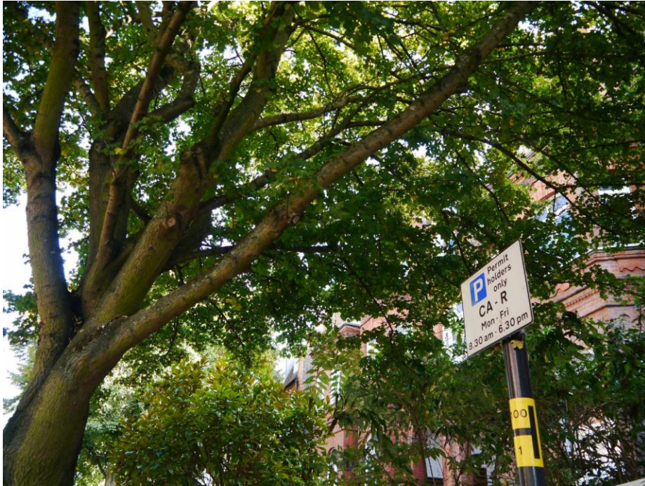
Figure 12 - View from 109 Greencroft Gardens