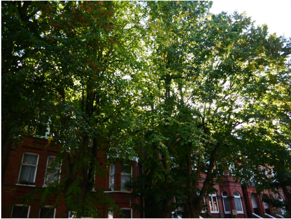
Figure 16 - View from 114 Greencroft Gardens