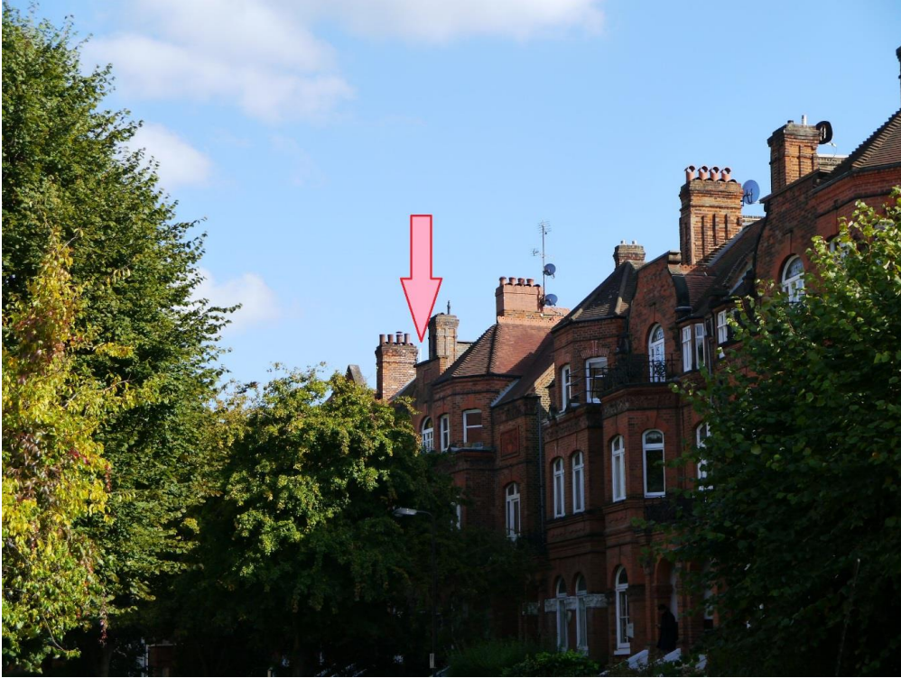
Figure 7 - View from entrance to flats 18-25 West End Court - Corner of Greencroft Gardens and Priory Road