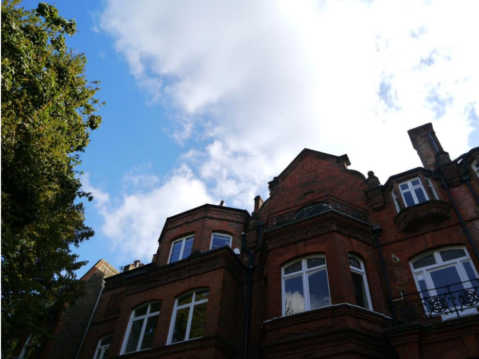
Figure 10 - View from 105 Greencroft Gardens