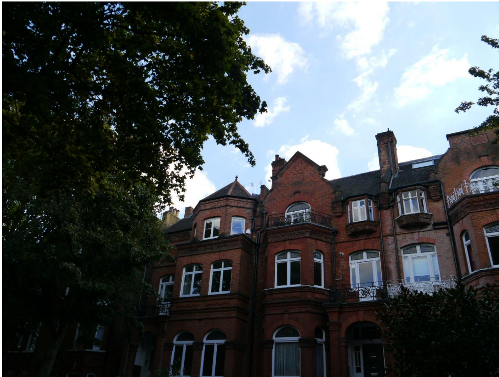
Figure 4 - View from 122 Greencroft Gardens