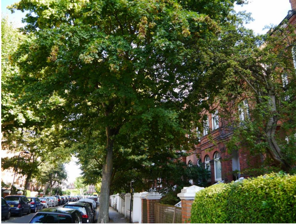
Figure 14 - View from 113 Greencroft Gardens

Visibility on the North side of Greencroft Gardens heading westward disappeared at the boundary for 124 and continued until the slight glimpse was possible as described above at West End Court, then disappeared thereafter heading westward. Heading east the view disappeared at 118, though in winter it may be possible to obtain similar views as was possible from 101 Greencroft, though these would be greatly obscured even by bare tree branches.