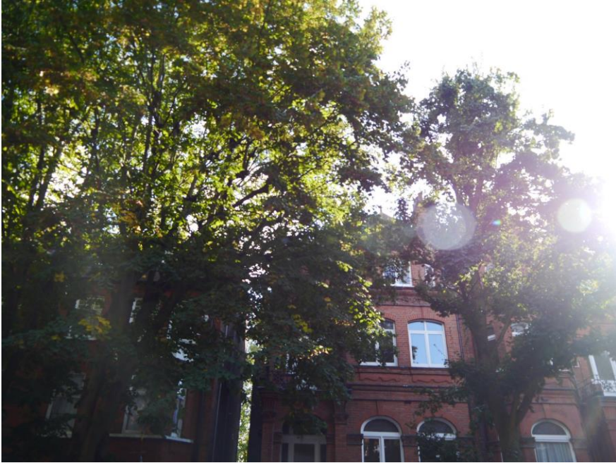
Figure 18 - View from 118 Greencroft Gardens