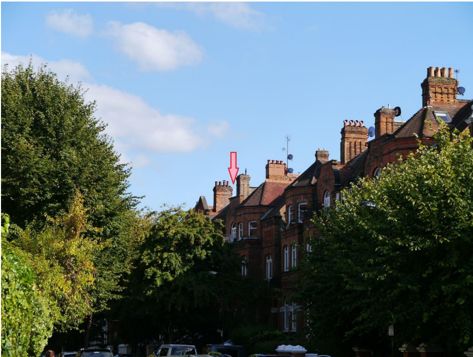
Figure 8 - View from entrance to flats 9-17 West End Court - Corner of Greencroft Gardens and Priory Road