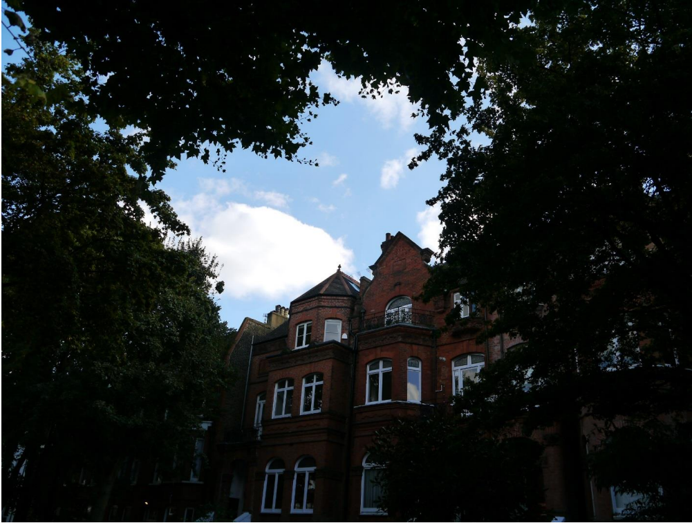
Figure 5 - View from boundary between 124 & 122 Greencroft Gardens

In addition there was a point of visibility from the front of 101 Greencroft Gardens, though this was of a significantly shorter distance of approximately 5 paces. Here the full height was visible over a distance of 1.5 meters of the mock up, giving a viewable surface area of the proposed balustrade of 1.8 m 2 .