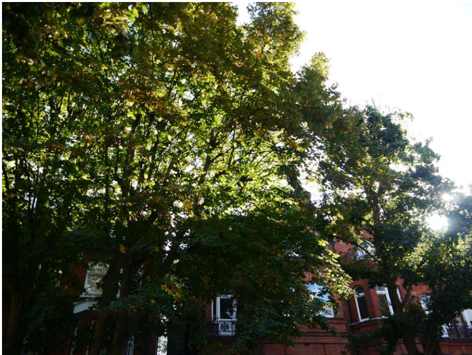
Figure 17 - View from 116 Greencroft Gardens