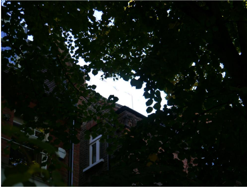
Figure 6 - View from 101 Greencroft Gardens

The final point where I was able to find some visibility of the mock up was at the end of Greencroft Gardens near the corner of Priory Road. Near the entrance to Flats 18-25 of West End Court and extending to the entrance to Flats 9-17 of West End Court a small section of the mock up was visible between the chimney stacks of 103 Greencroft Gardens and 105 Greencroft Gardens. The photographs below are at maximum zoom of a 14-42 lens, as at normal zoom the mock up was not discernable, and with a large red arrow to show how much was visible at that point.