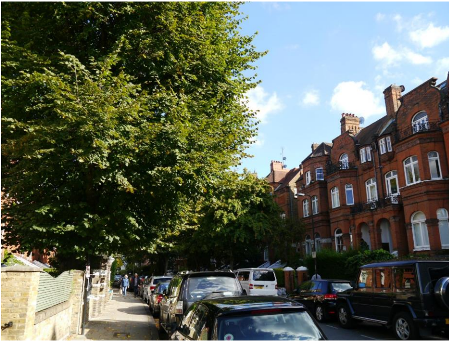
Figure 21 - View from 134 Greencroft Gardens