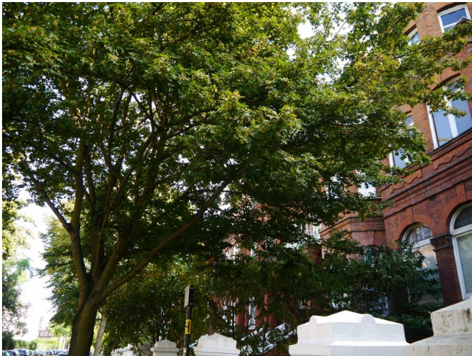
Figure 13 - View from 111 Greencroft Gardens