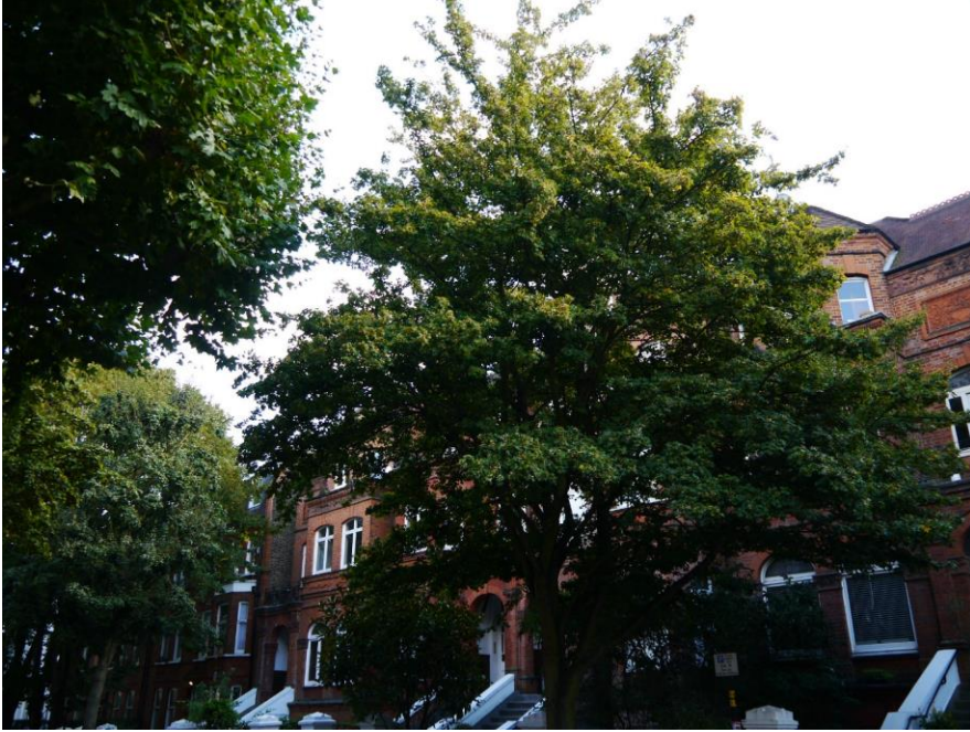
Figure 20 - View from 126 Greencroft Gardens