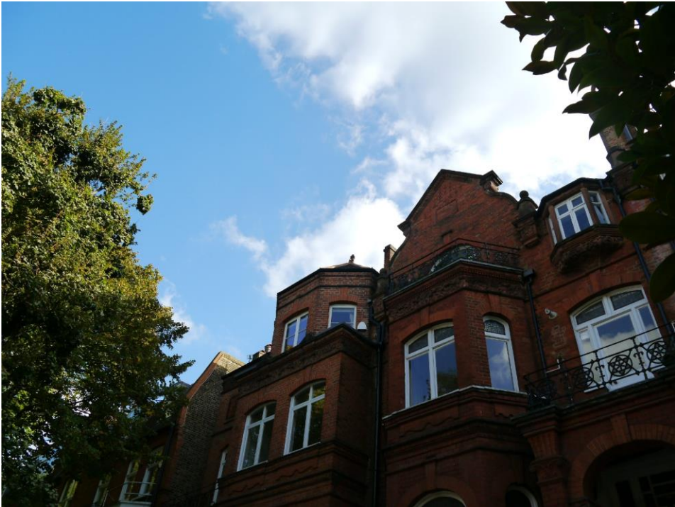
Figure 11 - View from 107 Greencroft Gardens