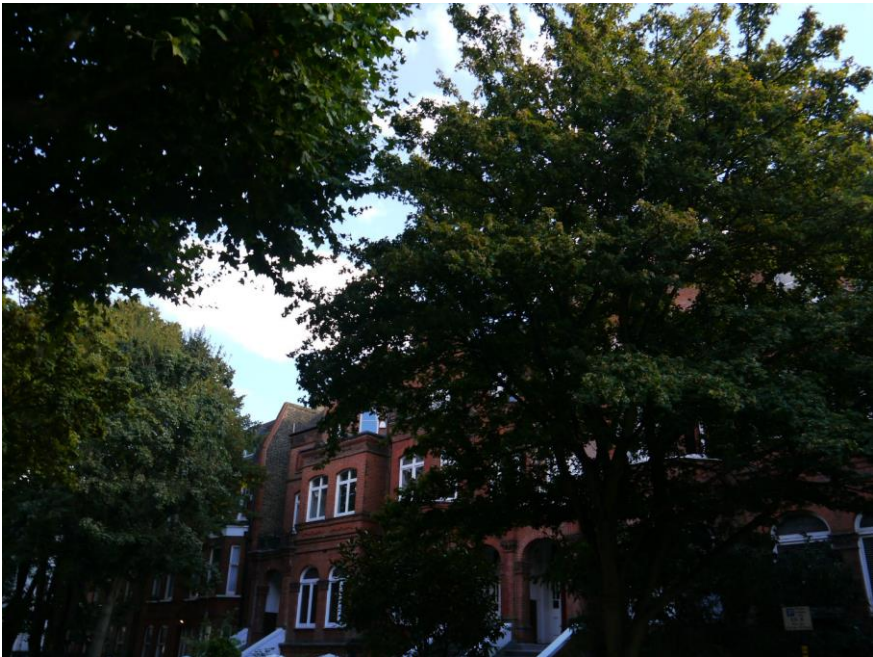
Figure 19 - View from 124 Greencroft Gardens