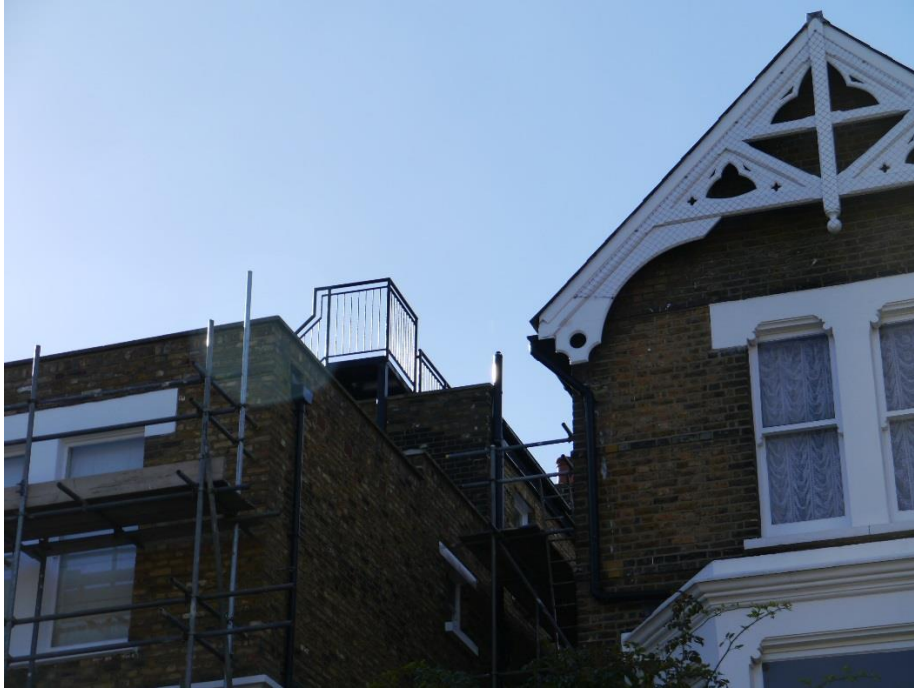
Figure 6 - Roof level railings at 91 Priory Road as seen from 90 Priory Road