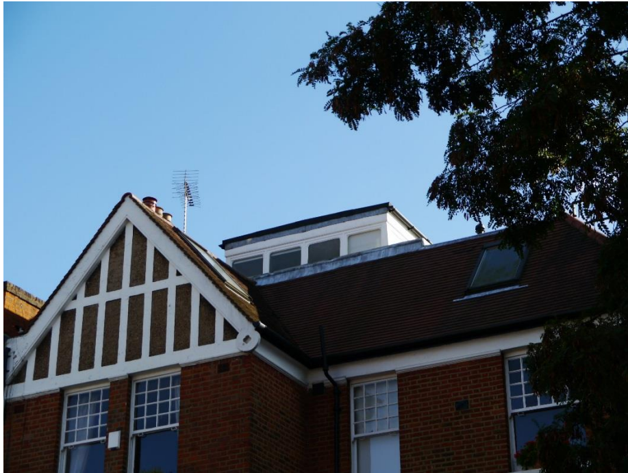
Figure 9 - Rooftop extension to 59 Compayne Gardens as seen from 68 Compayne