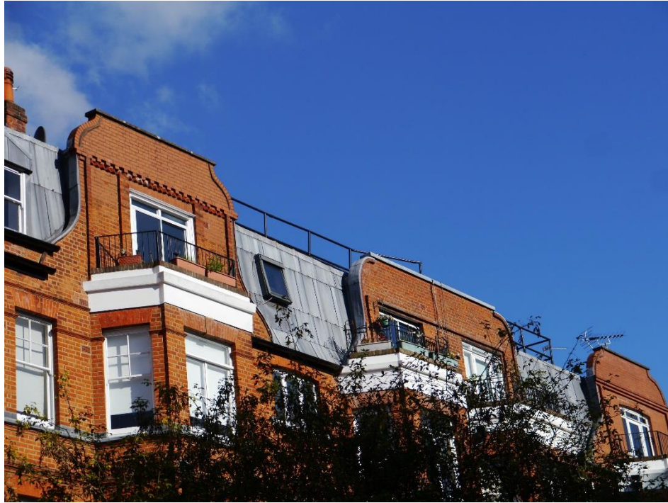
Figure 16 – Railings at 68 Fairhazel Gardens as seen from 25 Compayne Gardens