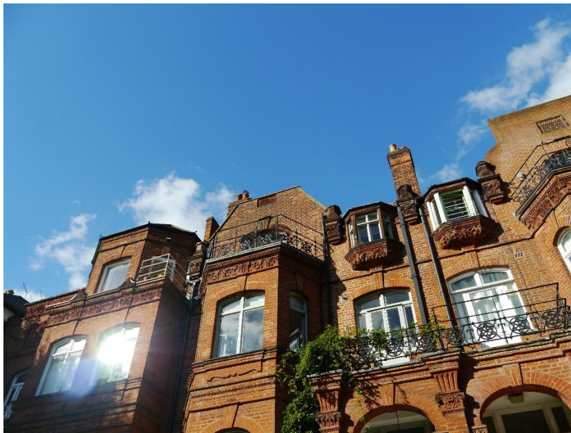
Figure 3 - Railings extension of 3rd floor balcony and adaptation from decorative to usable space of 126 Greencroft Gardens as seen from 126 Greencroft