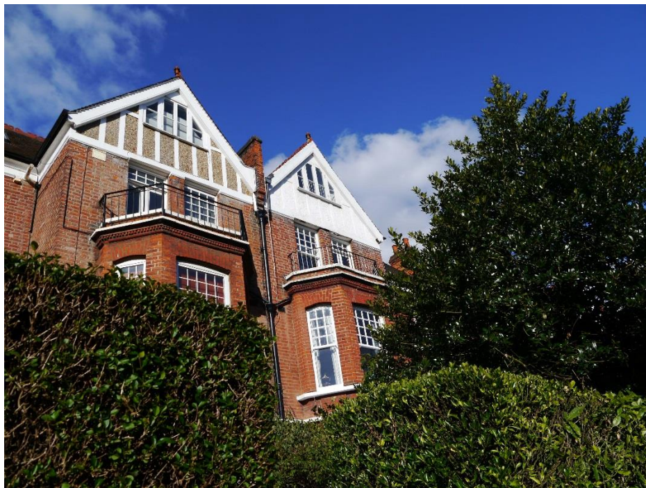
Figure 11 - Installation of railings on balconies of 64 & 62 Compayne Gardens as seen from 64 Compayne