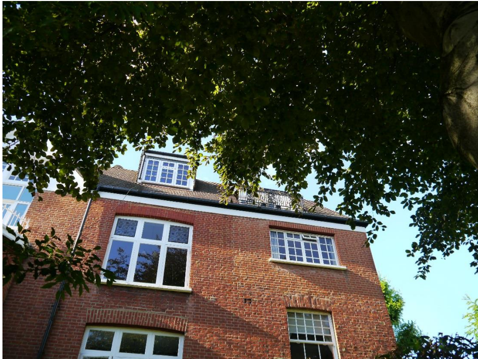
Figure 15 -Railings and balcony of 38 Compayne Gardens as seen from 38 Compayne