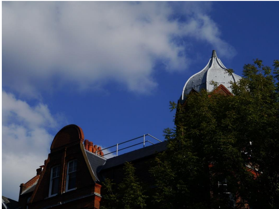
Figure 17 – Railings at 38 Canfield Gardens as seen from 63 Canfield