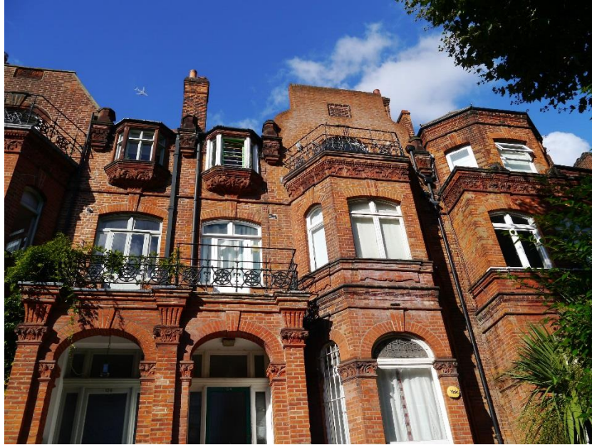
Figure 2- Second and third floor balcony railing extensions of 124 Greencroft Gardens as seen from 124 Greencroft Gardens