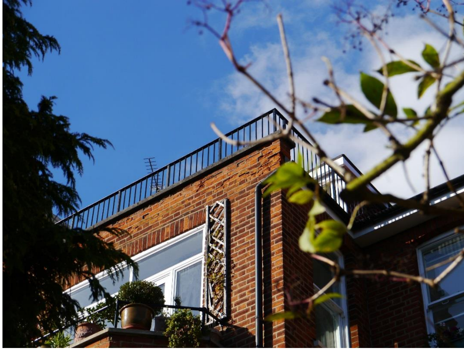
Figure 12 - Rooftop railings on 58 Compayne Gardens as seen from 58 Compayne Gardens