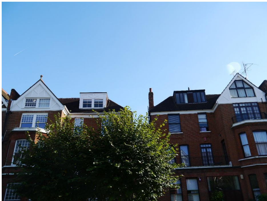
Figure 13 - Dormer windows on 33 & 31 Compayne Gardens and railings of 33, as seen from 42 Compayne