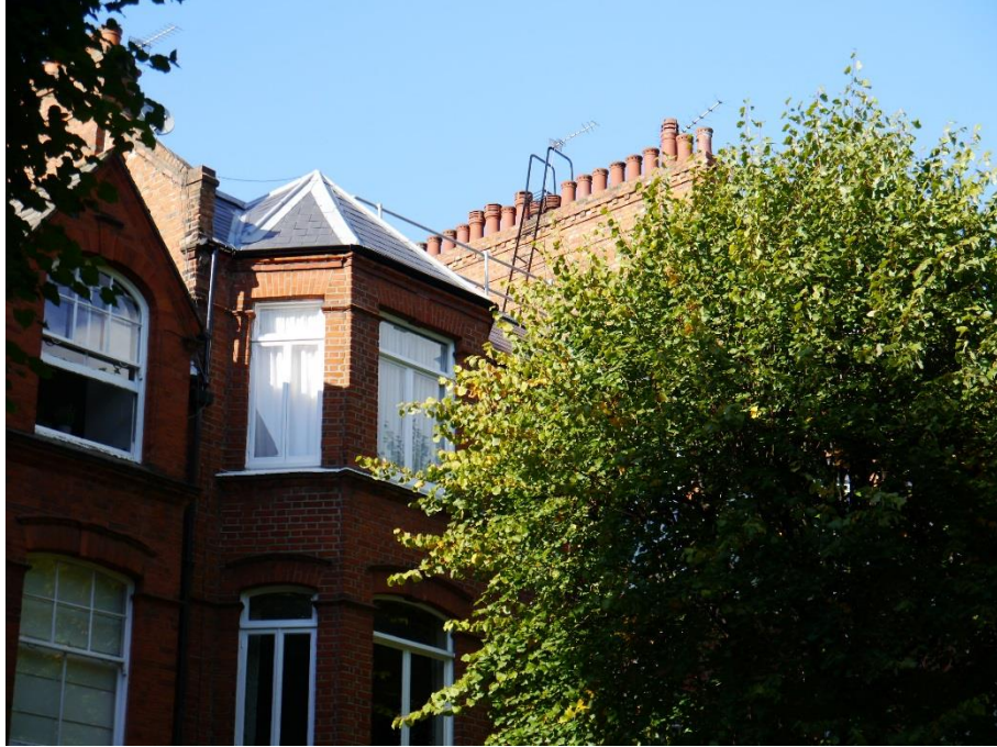
Figure 20 - Railings at 14 Canfield Gardens as seen from 25 Canfield