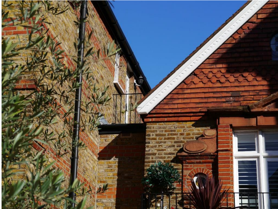
Figure 4 - Roof level railings at 90A Priory Road as seen from Priory Road