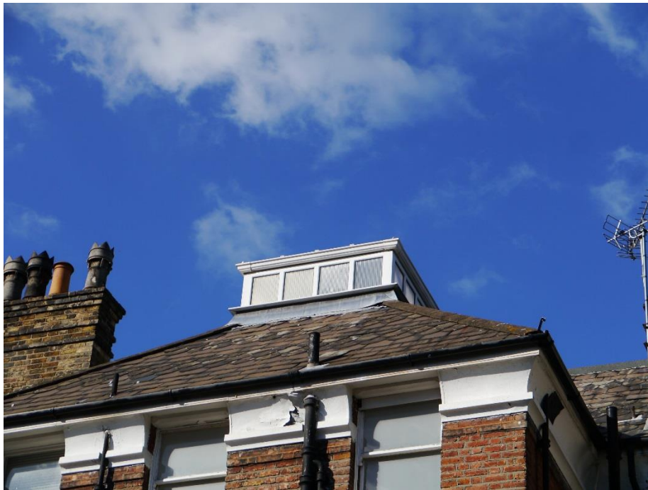
Figure 7 - Conservatory addition to roof of 78 Compayne Gardens as seen from 99 Priory Road