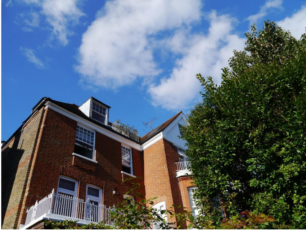
Figure 14 - Installation of balcony and railings at 40 Compayne Gardens as seen from 40 Compayne