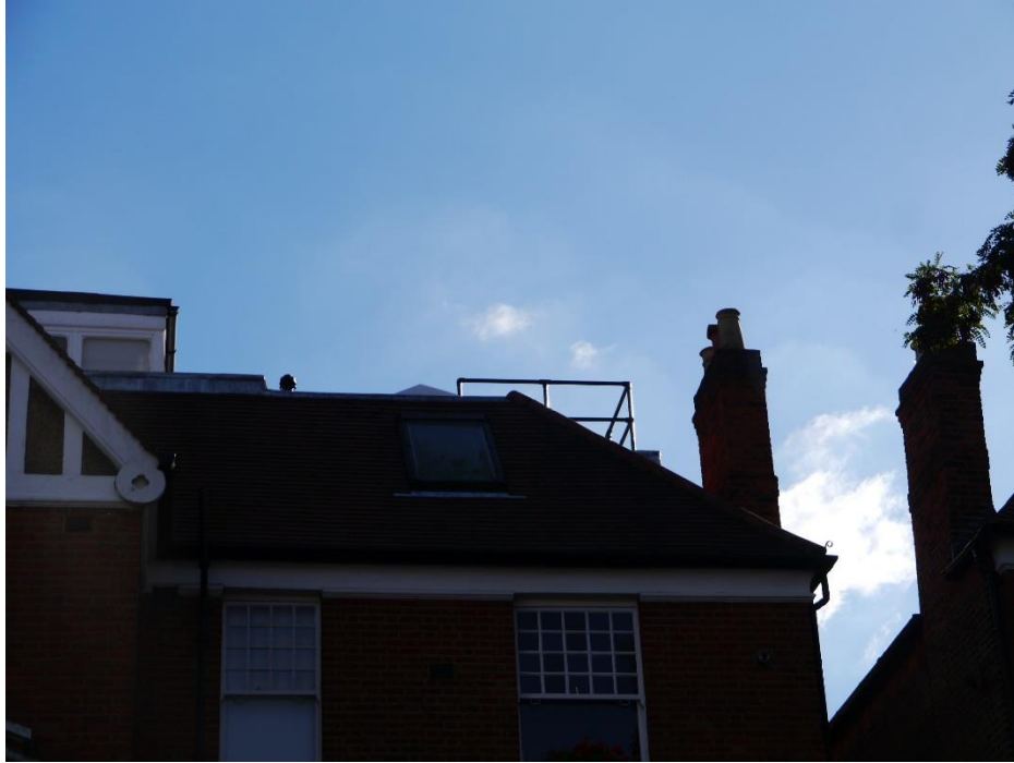
Figure 10 - Rooftop railings of 59 Compayne Gardens as seen from 64 Compayne