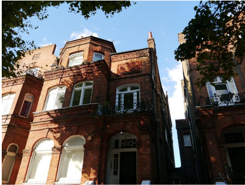
Figure 1 - Extension to railings at 122 Greencroft Gardens as seen from 122 Greencroft

This document has been produced to show a sample of the many alterations that have been made to highly visible parts of the South Hampstead Conservation Area, mainly additions of railings to enable original decorative balconies to be converted to outside usable space, railing installations at roof level, and other alterations to roof level such as dormer or conservatory installation. We believe that our proposal is less visible than these adaptations, and thus is consistent with previously established measures to minimize visual prominence. These 22 properties below are just a sample of alterations in the Conservation Area, if you were to make a comprehensive survey many more would be apparent.