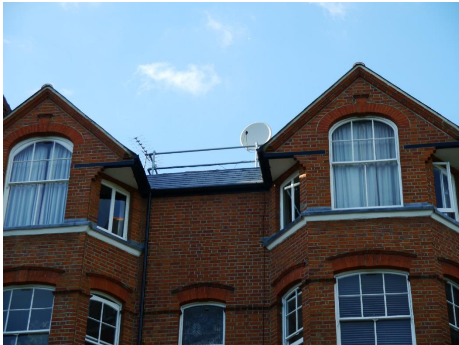
Figure 19 - Railings at 16 Canfield Gardens as seen from 37 Canfield