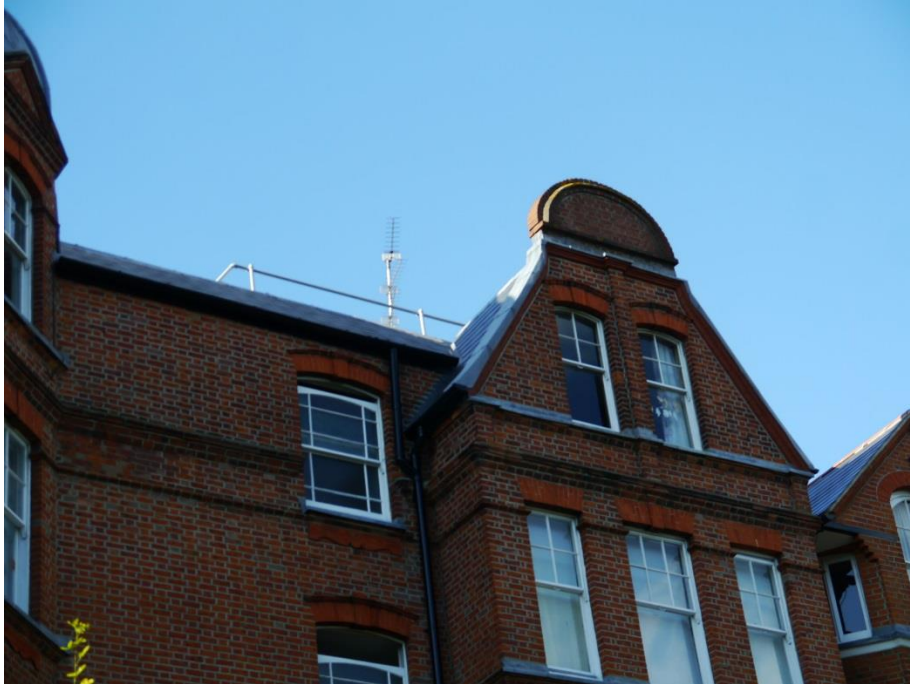
Figure 18 - 36 Railings at 36 Canfield Gardens as seen from 59 Canfield