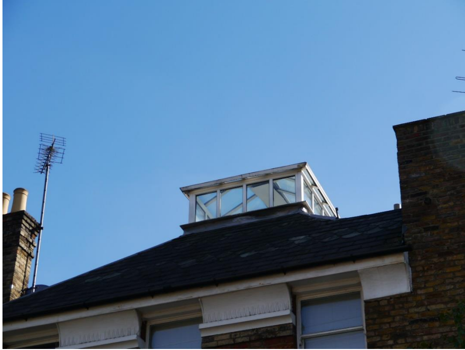
Figure 8 - Conservatory roof addition to 99 Priory Road as seen from 78 Compayne Gardens