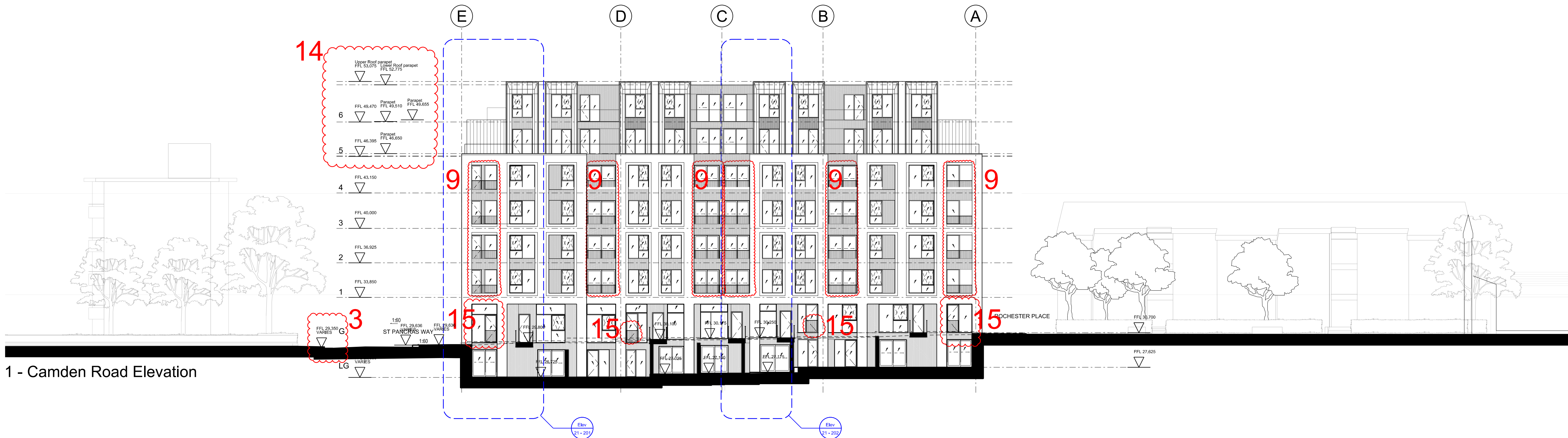
1 - Camden Road Elevation