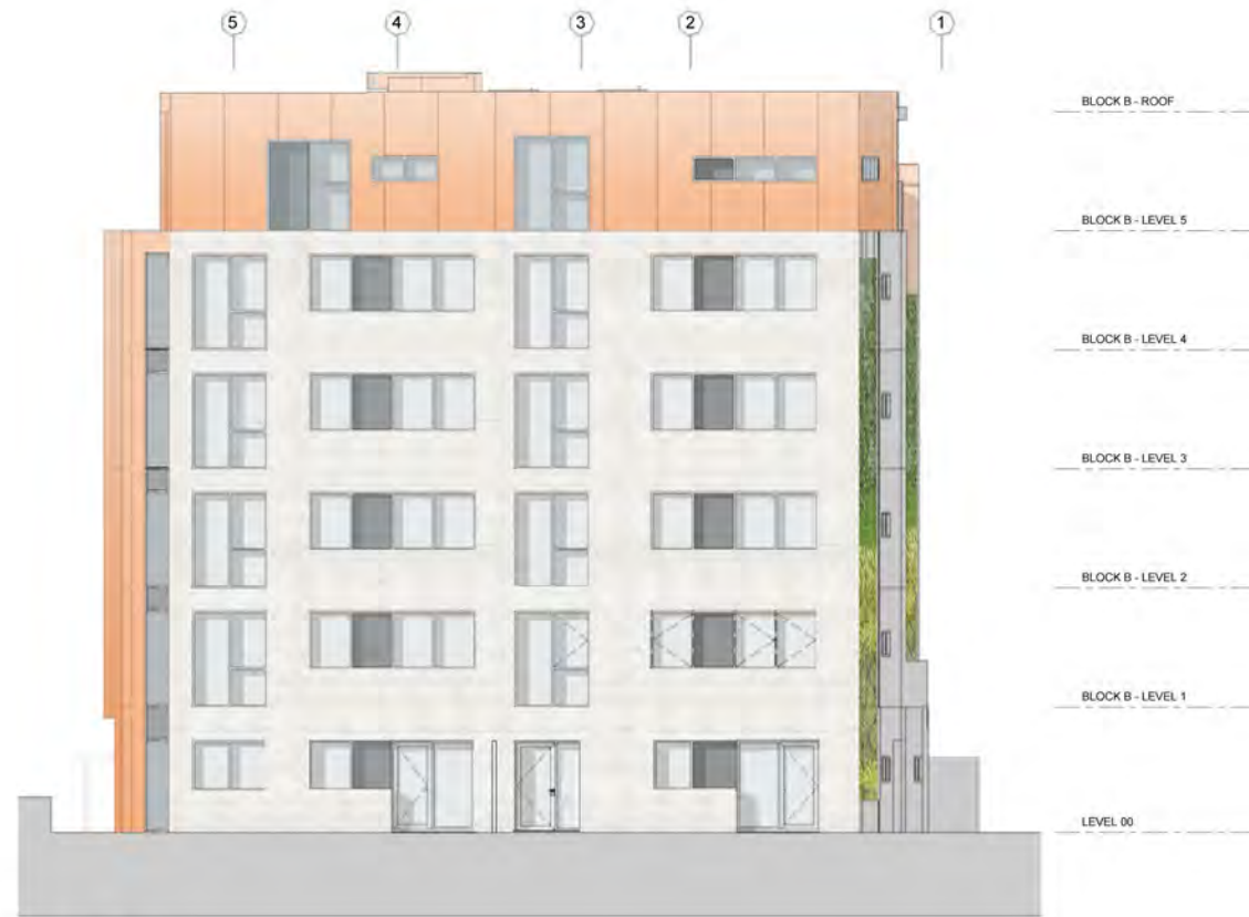
1 NORTH ELEVATION - PLANNING 1 : 100