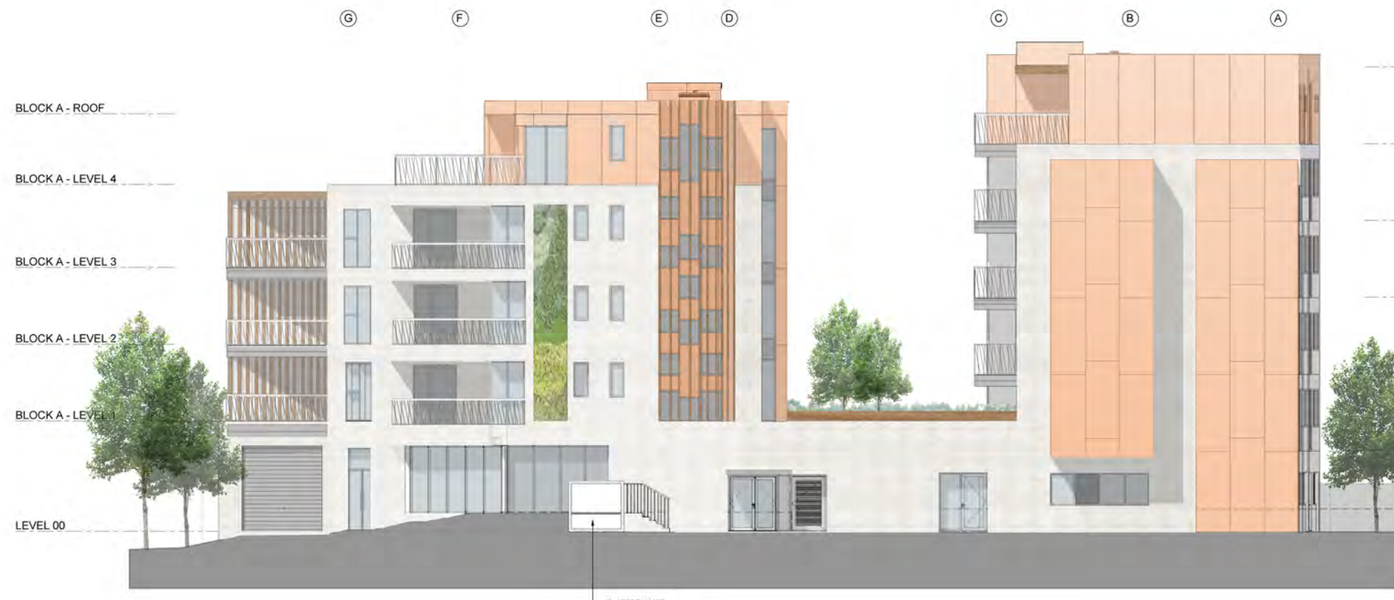
2 EAST ELEVATION - PLANNING 1 : 100

6. MANUFACTURER: CHARTER (OR SIMILAR APPROVED) FINISH: INTEGR8 ULTRA (INSULATED) COLOUR: RAL 7037