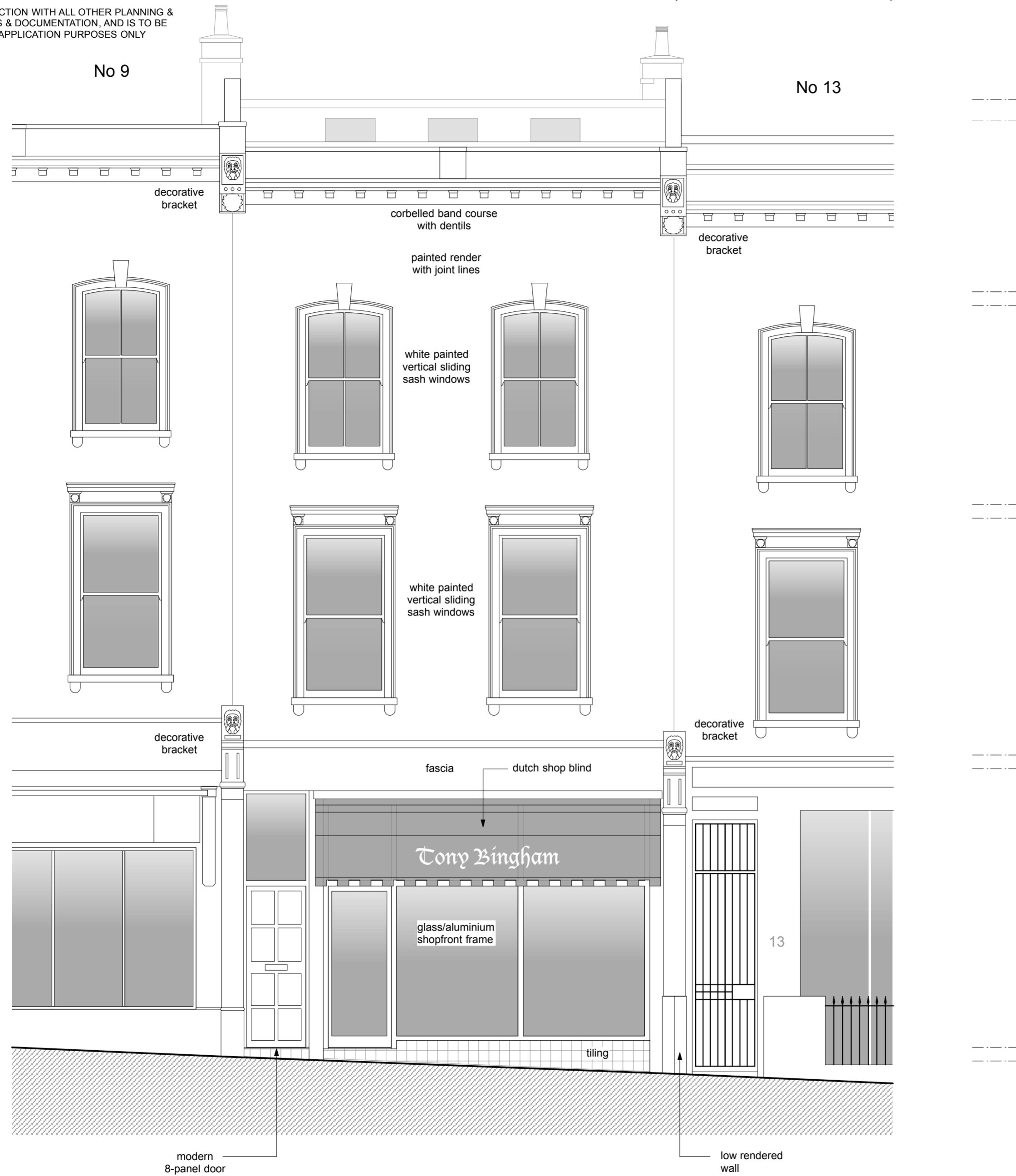
FRONT ELEVATION - AS ORIGINAL SEPT 2014

THIS DRAWING IS TO BE READ IN CONJUNCTION WITH ALL OTHER PLANNING & LISTED BUILDING APPLICATION DRAWINGS & DOCUMENTATION, AND IS TO BE USED FOR PLANNING & LISTED BUILDING APPLICATION PURPOSES ONLY