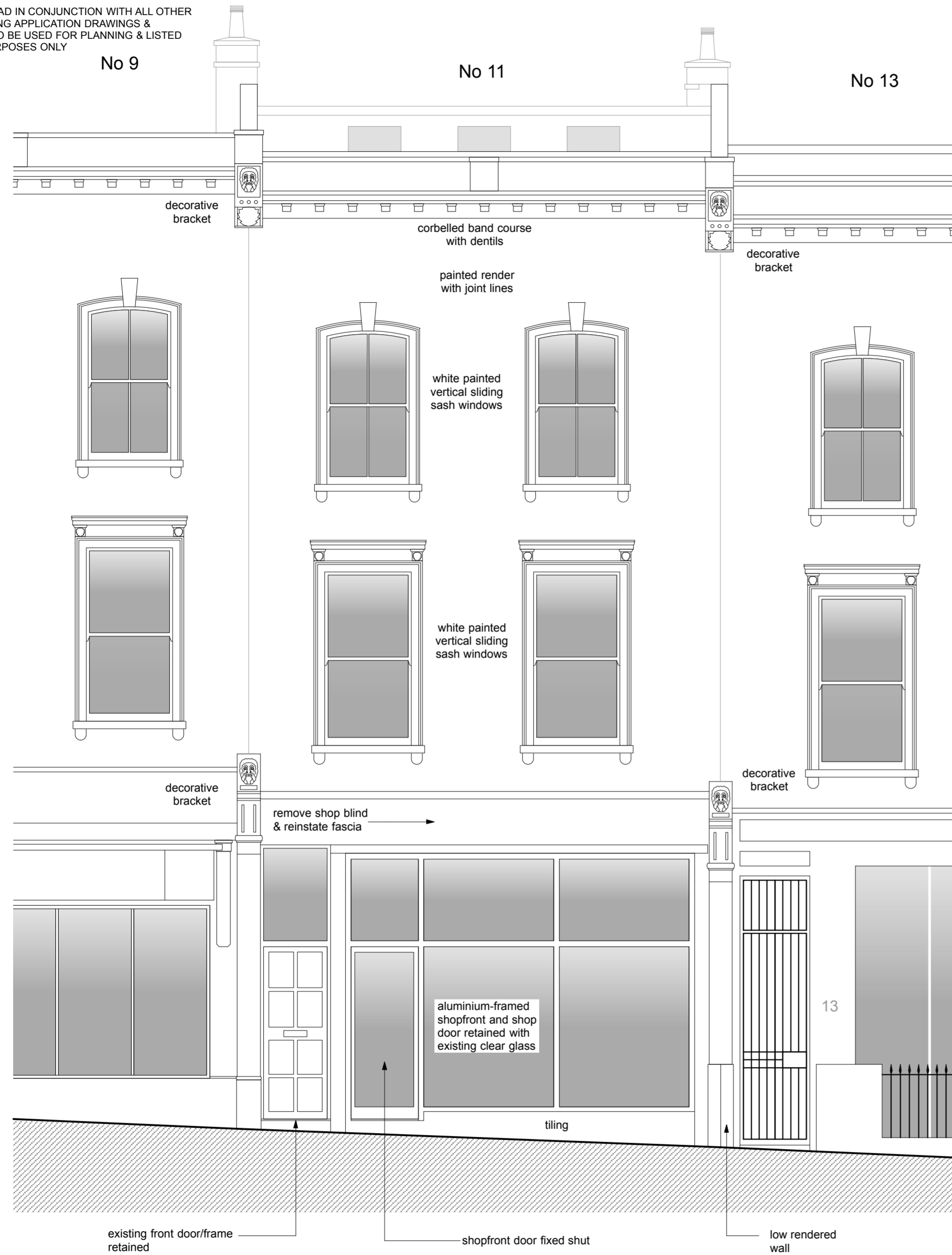
FRONT ELEVATION - PROPOSED

THIS DRAWING IS TO BE READ IN CONJUNCTION WITH ALL OTHER PLANNING & LISTED BUILDING APPLICATION DRAWINGS & DOCUMENTATION, AND IS TO BE USED FOR PLANNING & LISTED BUILDING APPLICATION PURPOSES ONLY