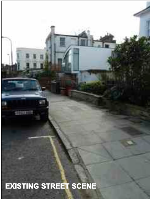
EXISTING STREET SCENE