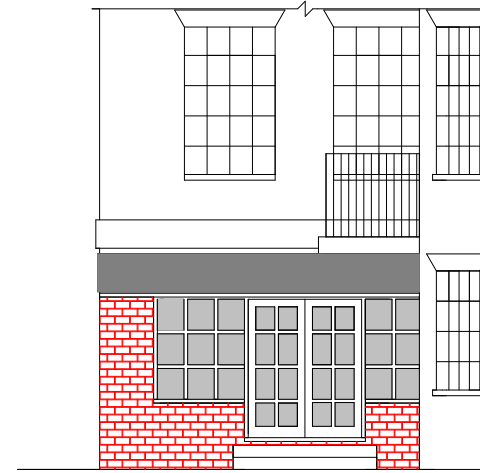
PROPOSED REAR/SIDE ELEVATION