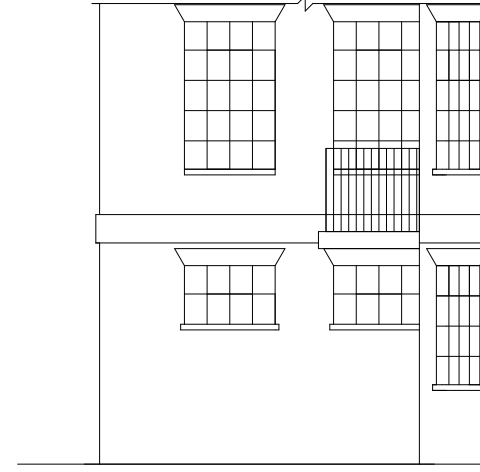
EXISTING REAR/SIDE ELEVATION