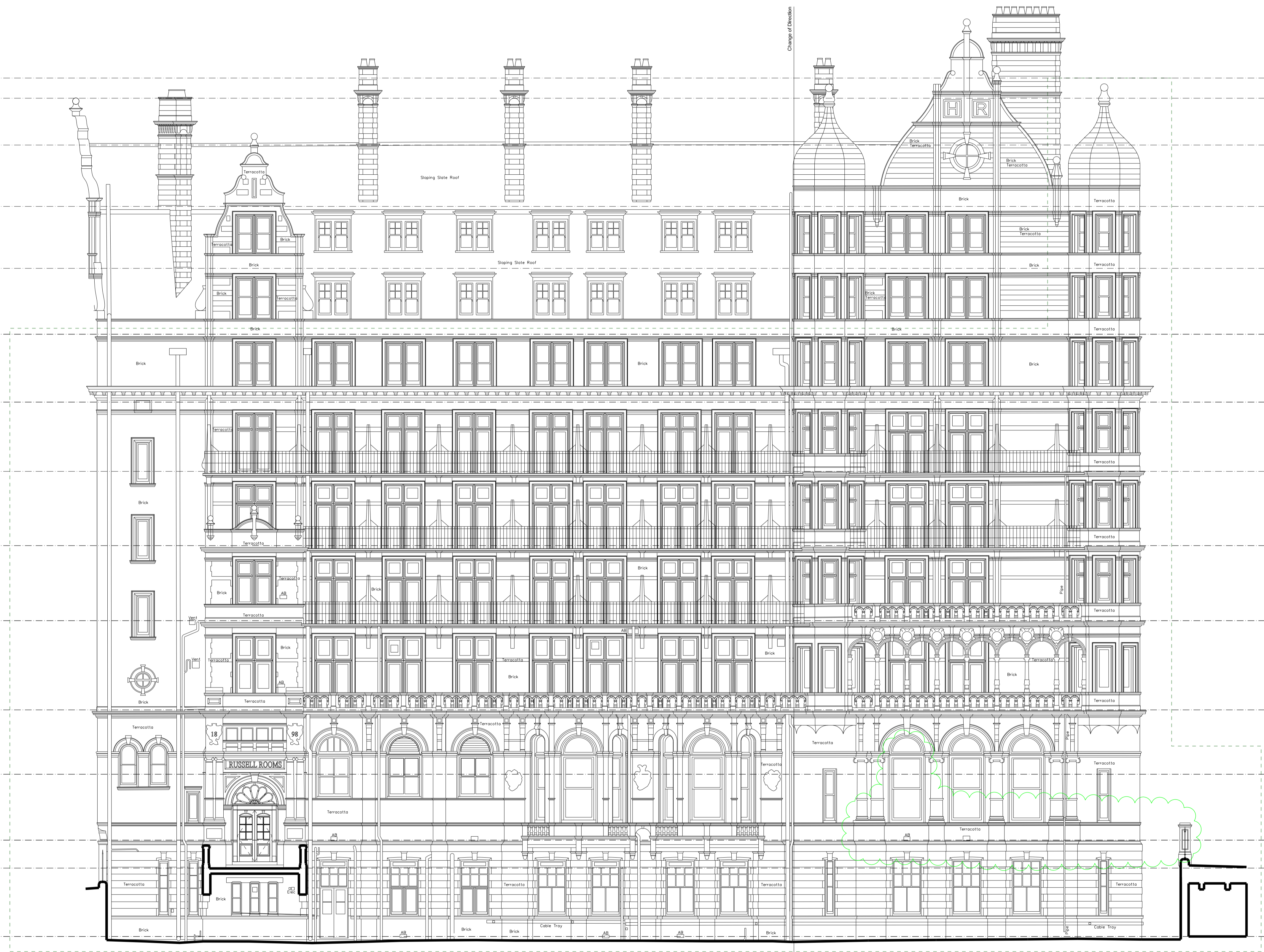
Elevation 4 - Bernard Street