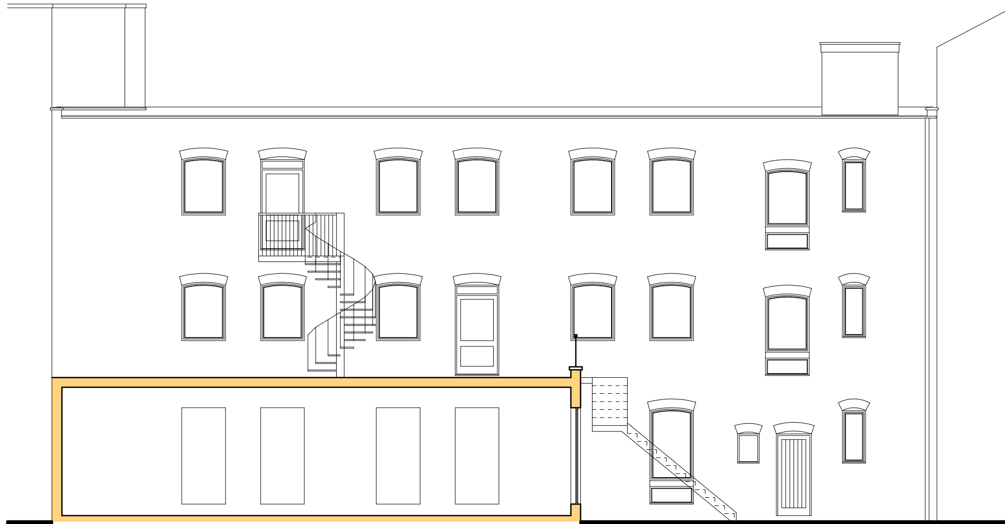
EXTG. REAR ELEVATION

NOTE: PLANS HAVE BEEN REPRODUCED FROM COPIES OF ORIGINAL BUILDING PLANS. NO GUARANTEE OF ACCURACY CAN BE GIVEN OR IS IMPLIED BY THEIR USE.