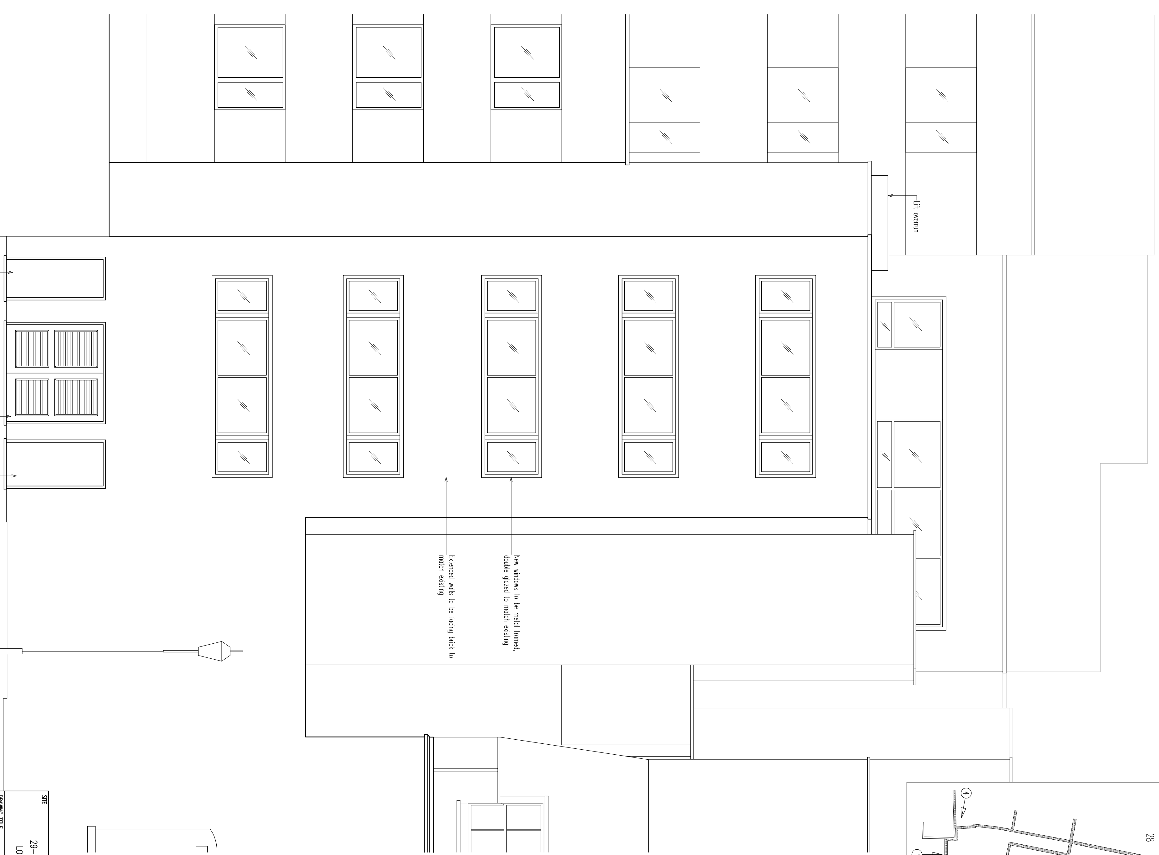
ELEVATION 1 [REAR] AS PROPOSED