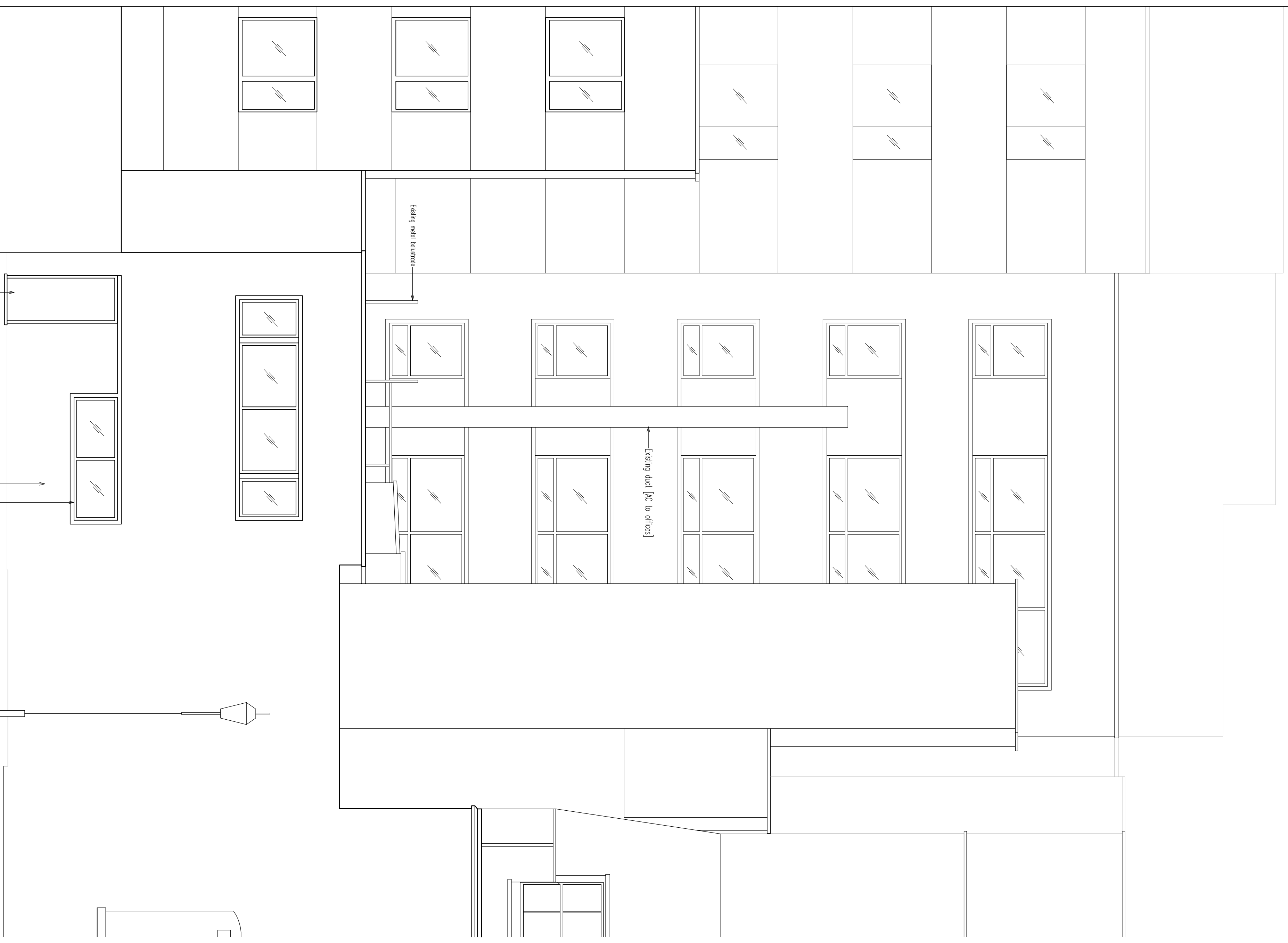
ELEVATION 1 [REAR] AS EXISTING