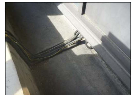
Survey photos of proposed location