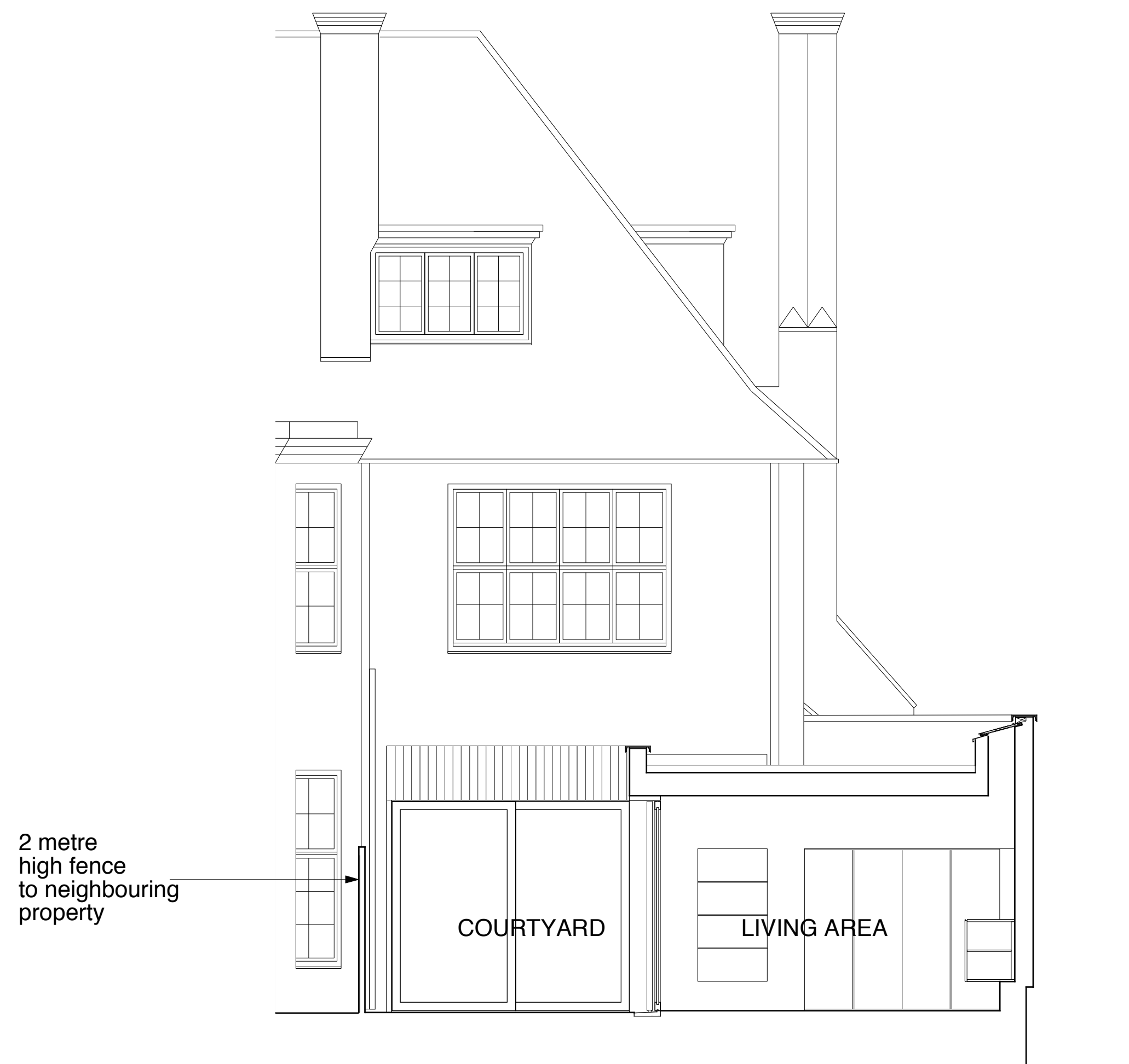
EXISTING SECTION AA