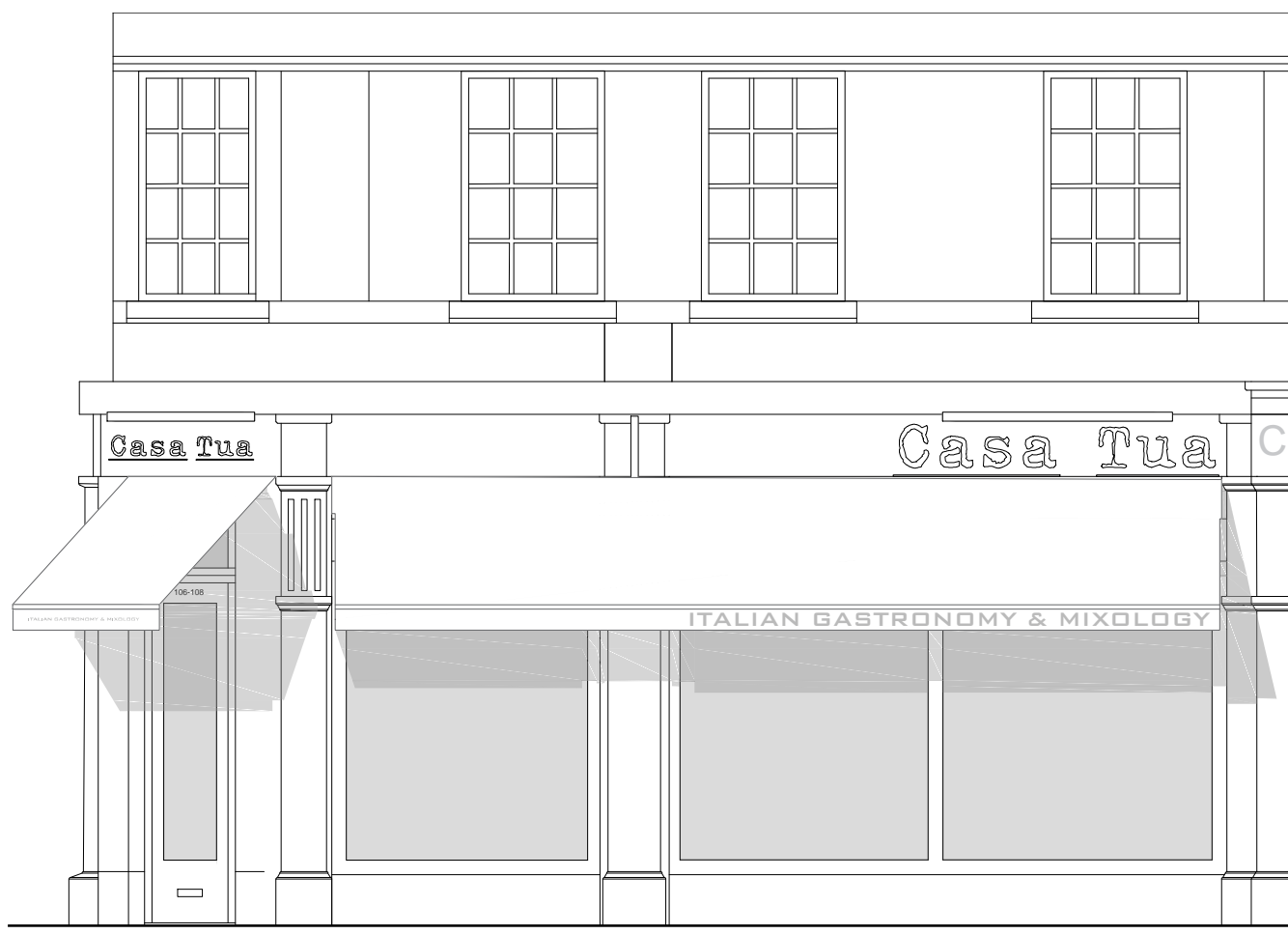
02 Proposed Elevation AA 1:50@A3