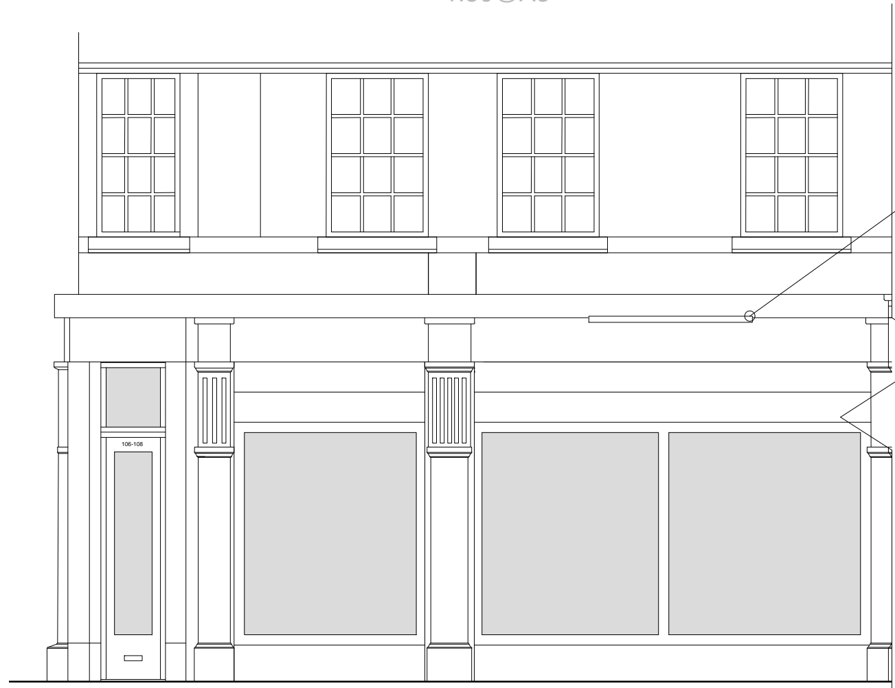
02 Existing Elevation CC 1:50@A3