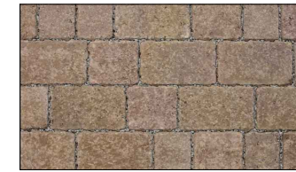
MARSHALLS TEGULA PRIORA PAVING; HARVEST