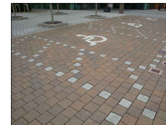
EXAMPLE OF PARKING BAY DEMARICATION