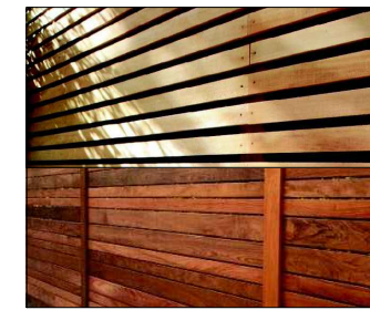
EXAMPLE OF HARDWOOD TIMBER PRIVACY SCREEN