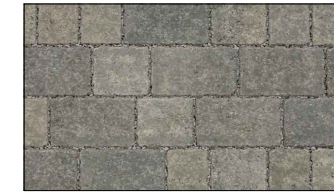
MARSHALLS TEGULA PRIORA PAVING; PENNANT GREY