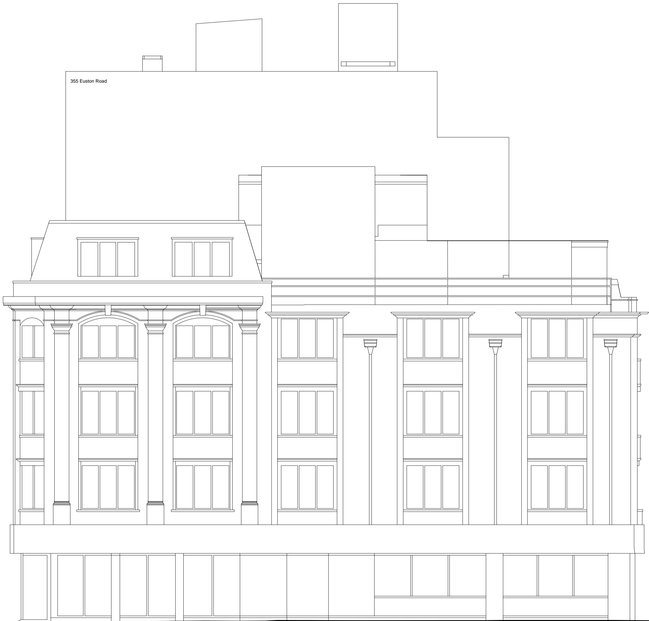
EXISTING Conway Street Elevation