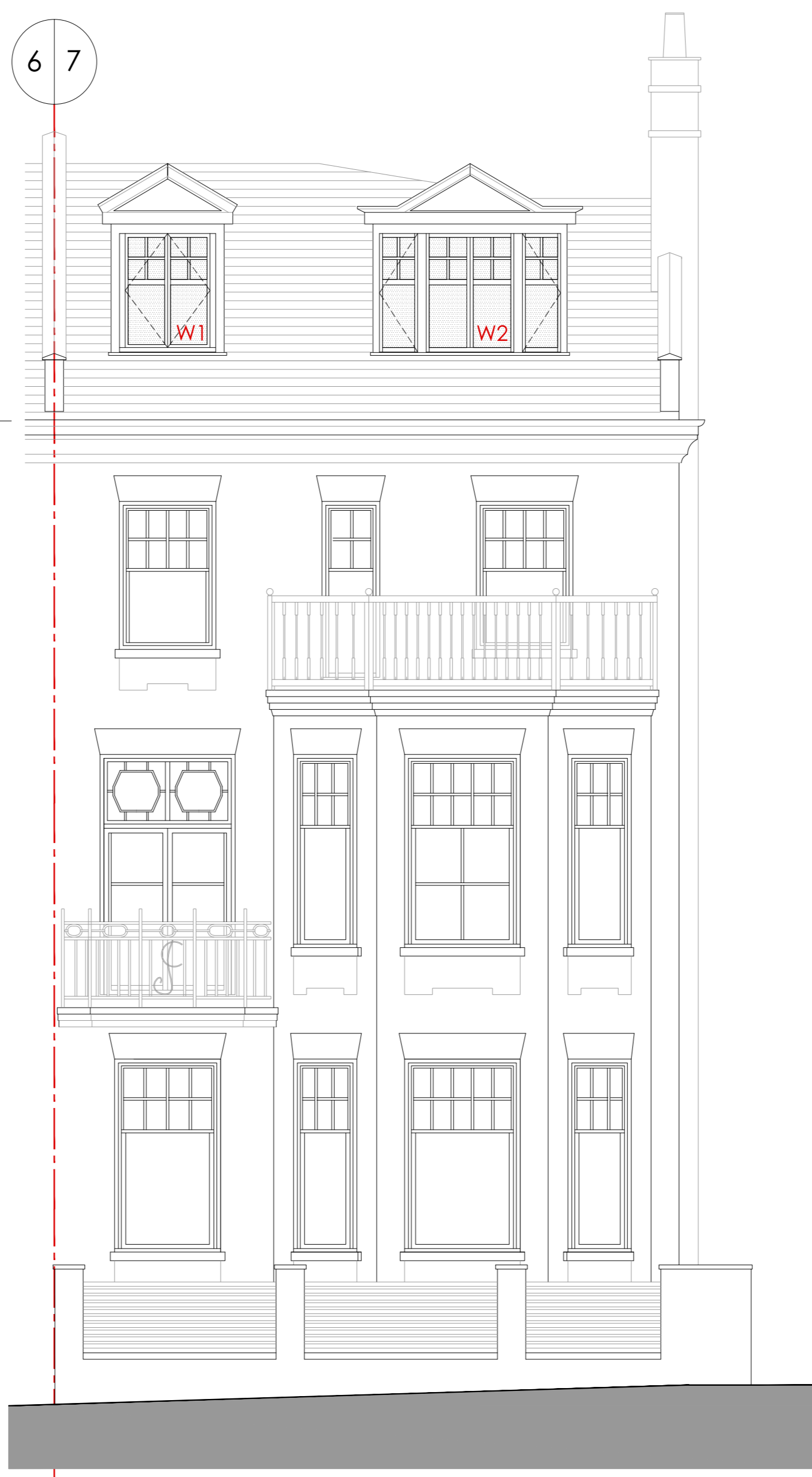
2 STREET ELEVATION PROPOSED 1:50