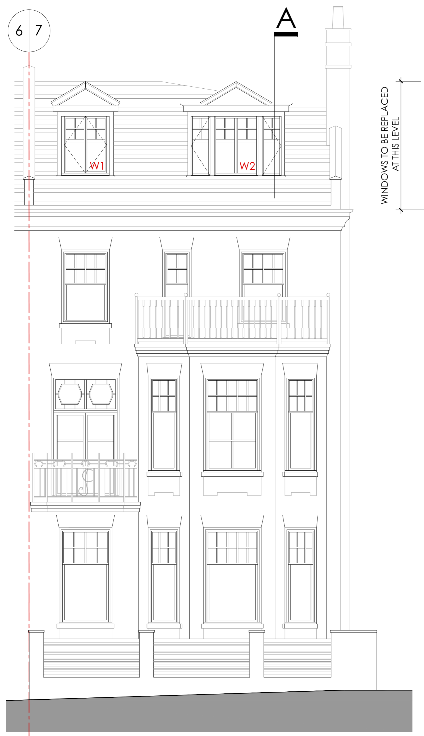
1 STREET ELEVATION EXISTING 1:50

NOTE: THIS DRAWING IS PROPERTY OF IMAGE ARCHITECTURE LTD. AND IS NOT TO BE REPRODUCED OR COPIED IN WHOLE OR IN PART WITHOUT PERMISSION. DO NOT SCALE FROM THIS DRAWING. THE CONTRACTOR IS TO CHECK ALL DIMENSIONS ON SITE. KEY PLAN