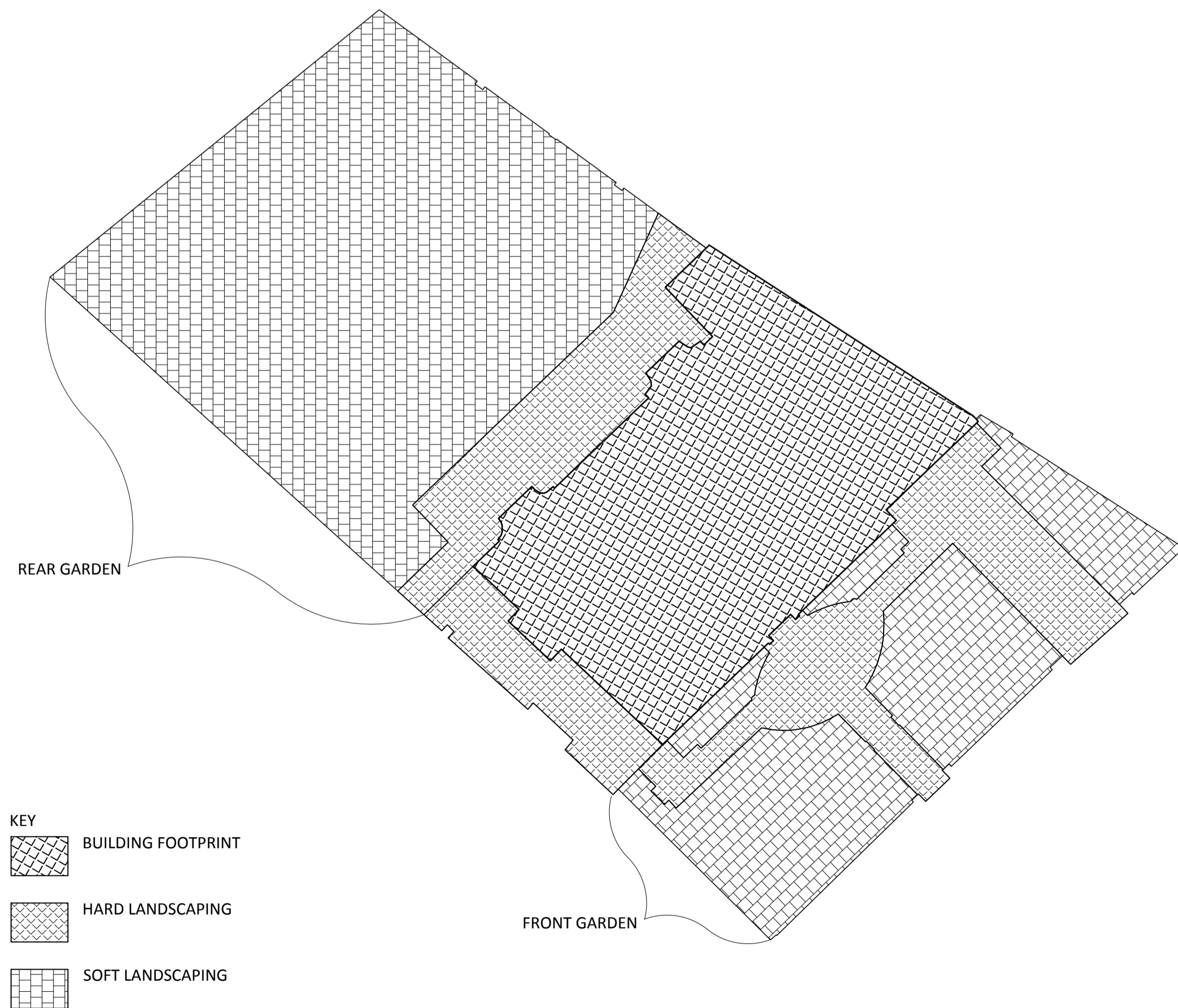
EXISTING HARD / SOFT LANDSCAPING AREAS SCALE 1:150 @ A1