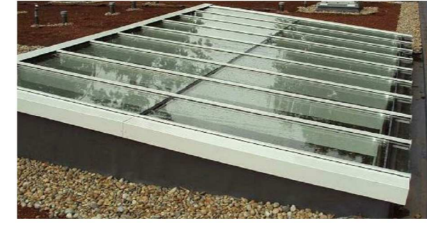
RF02 - Proposed Sloping Screen

Glazed mono-pitch roof - Overall finish of frames to be powder coated - colour from standard range to be agreed. The extent and provision of the glazing is to largely to the extent of the original design with a thicker frame and double glazing to comply with current building control requirements. Surrounding drainage and terrace paving will be repaired and reinstated on completion and Edge protection renewed as described below.