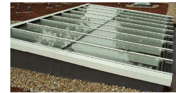
RF02 - Proposed Glazed Roof

Overall finish of frames to be powder coated - colour from standard range to be agreed. The extent and provision of the glazing is to largely to the extent of the original design with a thicker frame and double glazing to comply with current building control requirements. Surrounding drainage and terrace paving will be repaired and reinstated on completion and Edge protection renewed as described below.