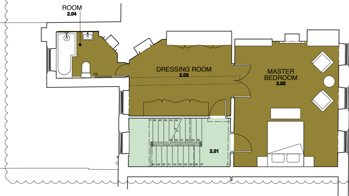
PROPOSED SECOND FLOOR PLAN