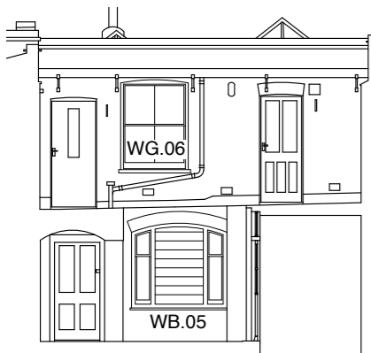
SECTION CC (EXISTING) KEY 1:125

Refer to dwg 21470A-8-3 for full details