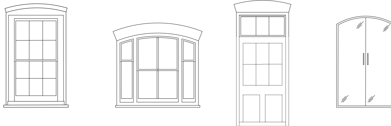
PROPOSED REAR AND SIDE ELEVATION WINDOWS