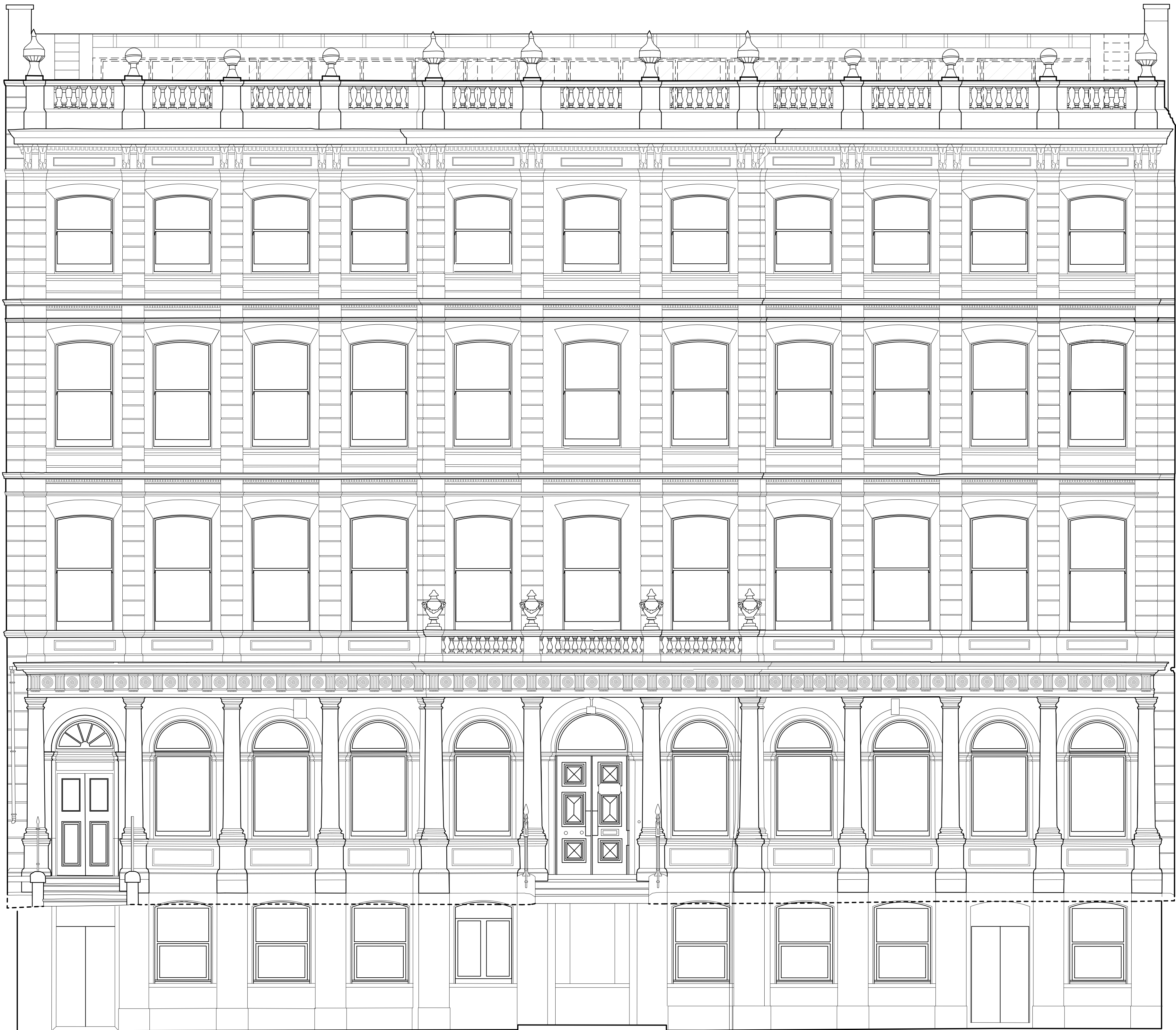
22 NW Elevation