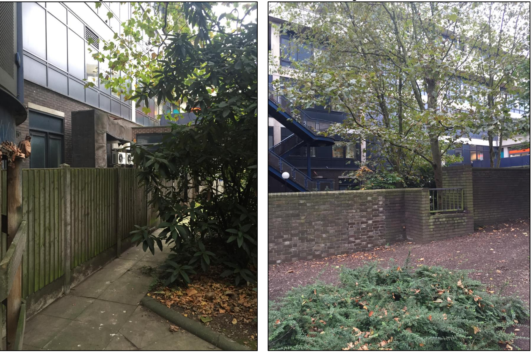
4. Brick Wall Screening