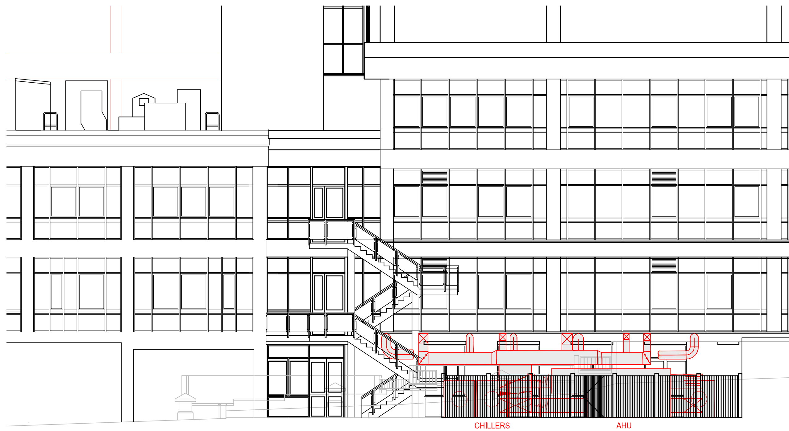
PROPOSED ELEVATION AT GARDEN LEVEL