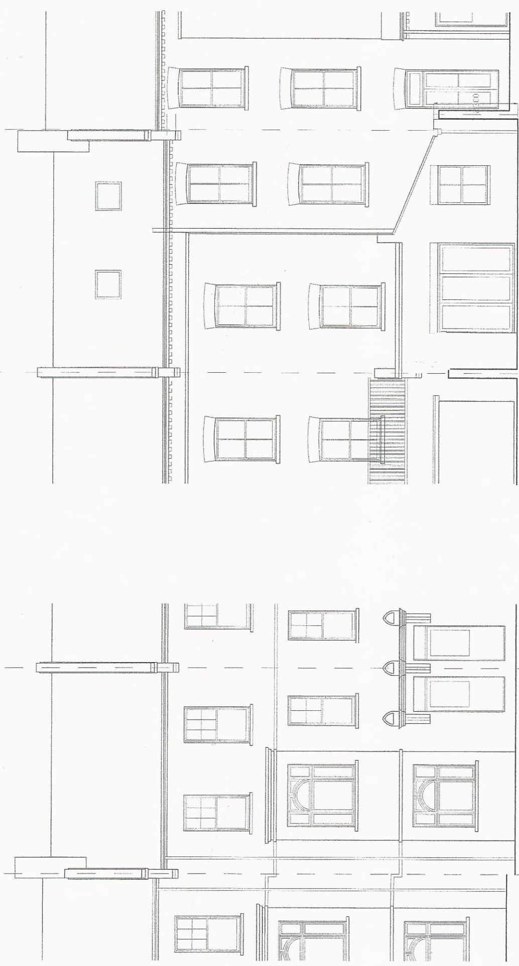
No101. Rear Elevation

Client: Project Title: 101 Constantine Road London NW3 2LR Drawing Title: EXISTING AS APPROVED Date: 23.06.2010 Scale: 1:50 @ A1 1:100 @ A3 Dwg. No.: CR.02.08 C HARTLEYS PROJECTS LTD PO BOX 43391 London N5 1SZ 020 7704 8272