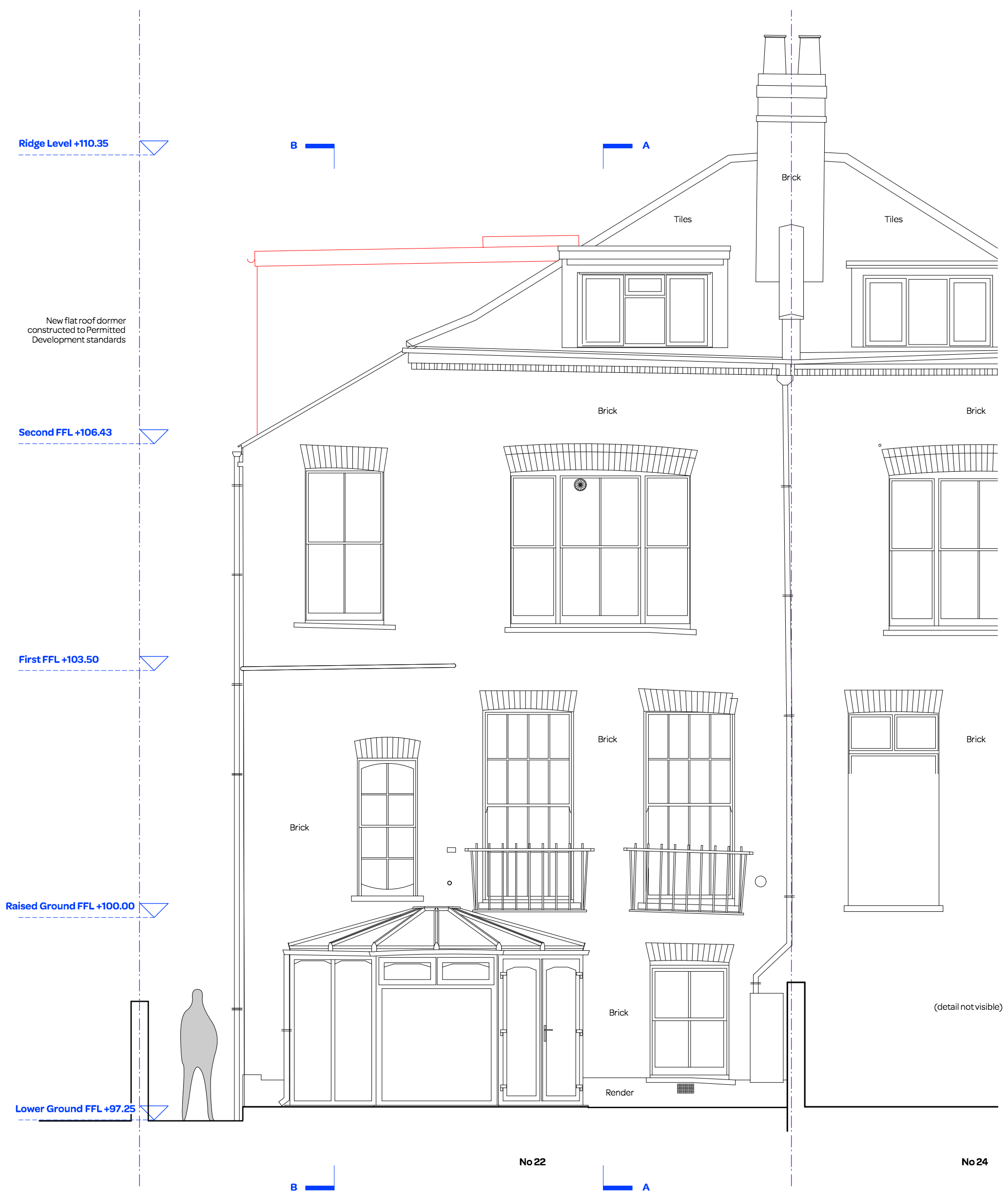
Rear Elevation Proposed