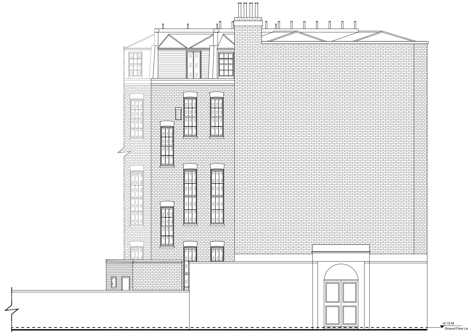
Existing Side Elevation A