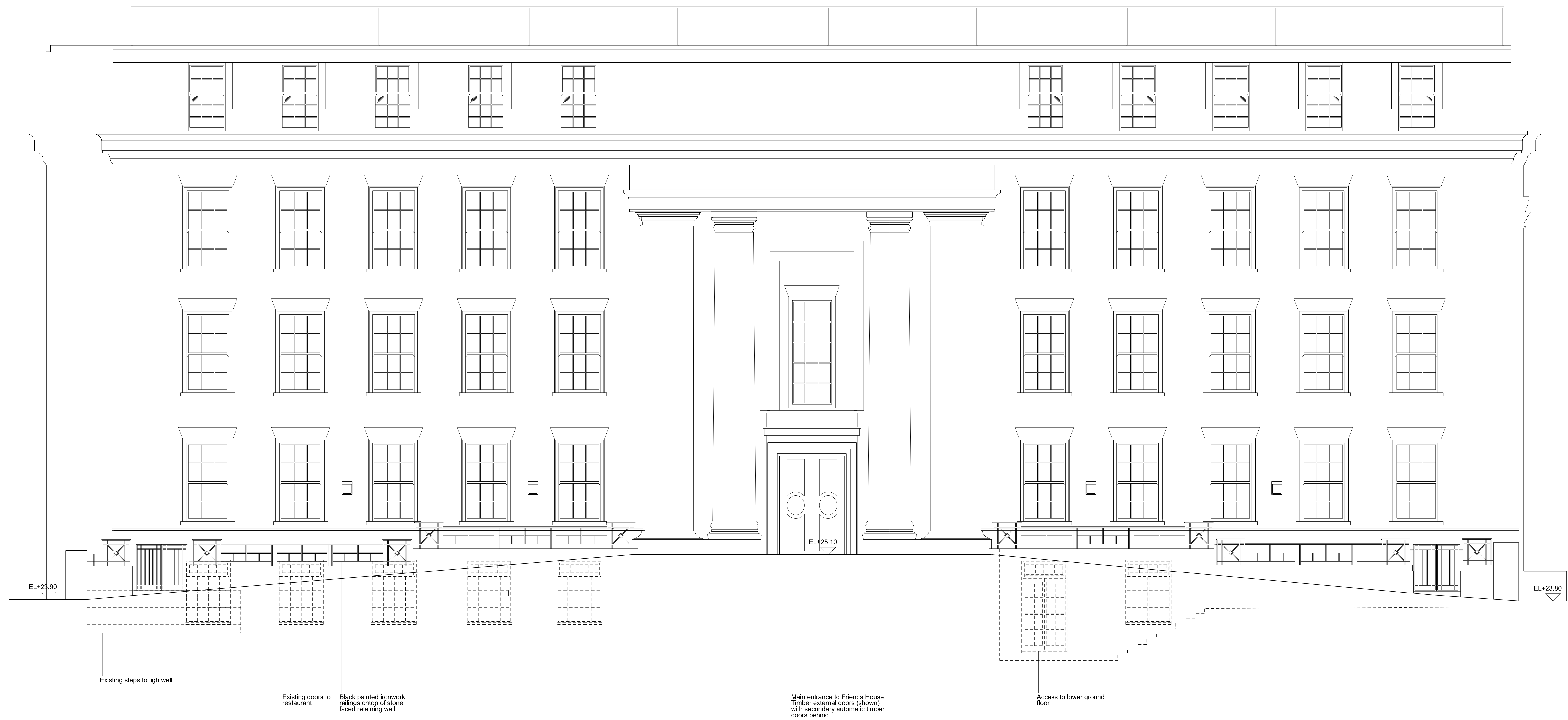
01 Section H-H Garden Terrace Sections