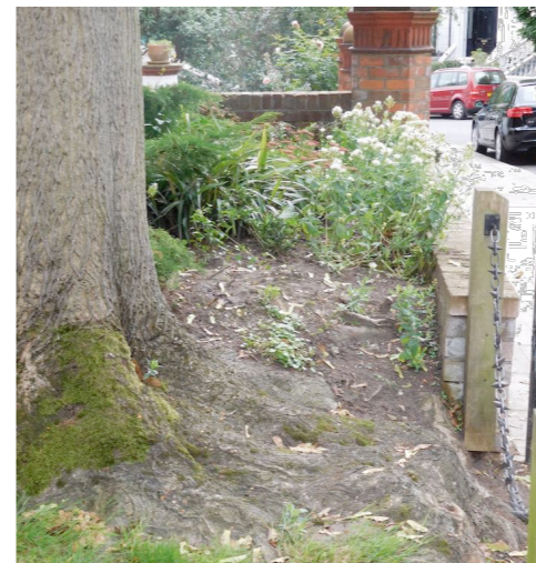
Tree root and boundary wall