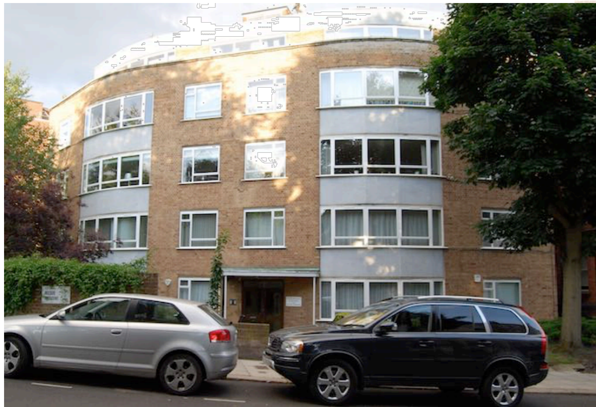
Street view of building