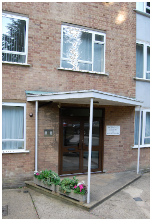
Entrance canopy and concrete path