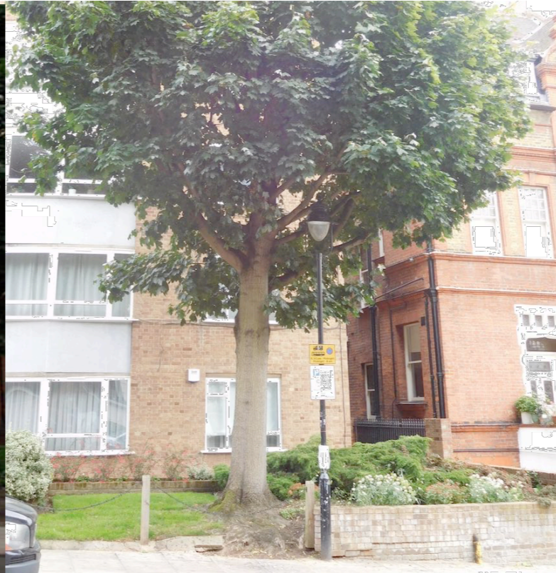
Boundary treatment and tree