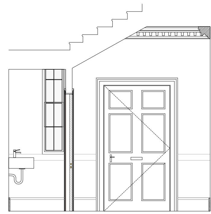
3 Existing WC Ground Floor Section 021

Existing basement stairs and vault retained behind partition