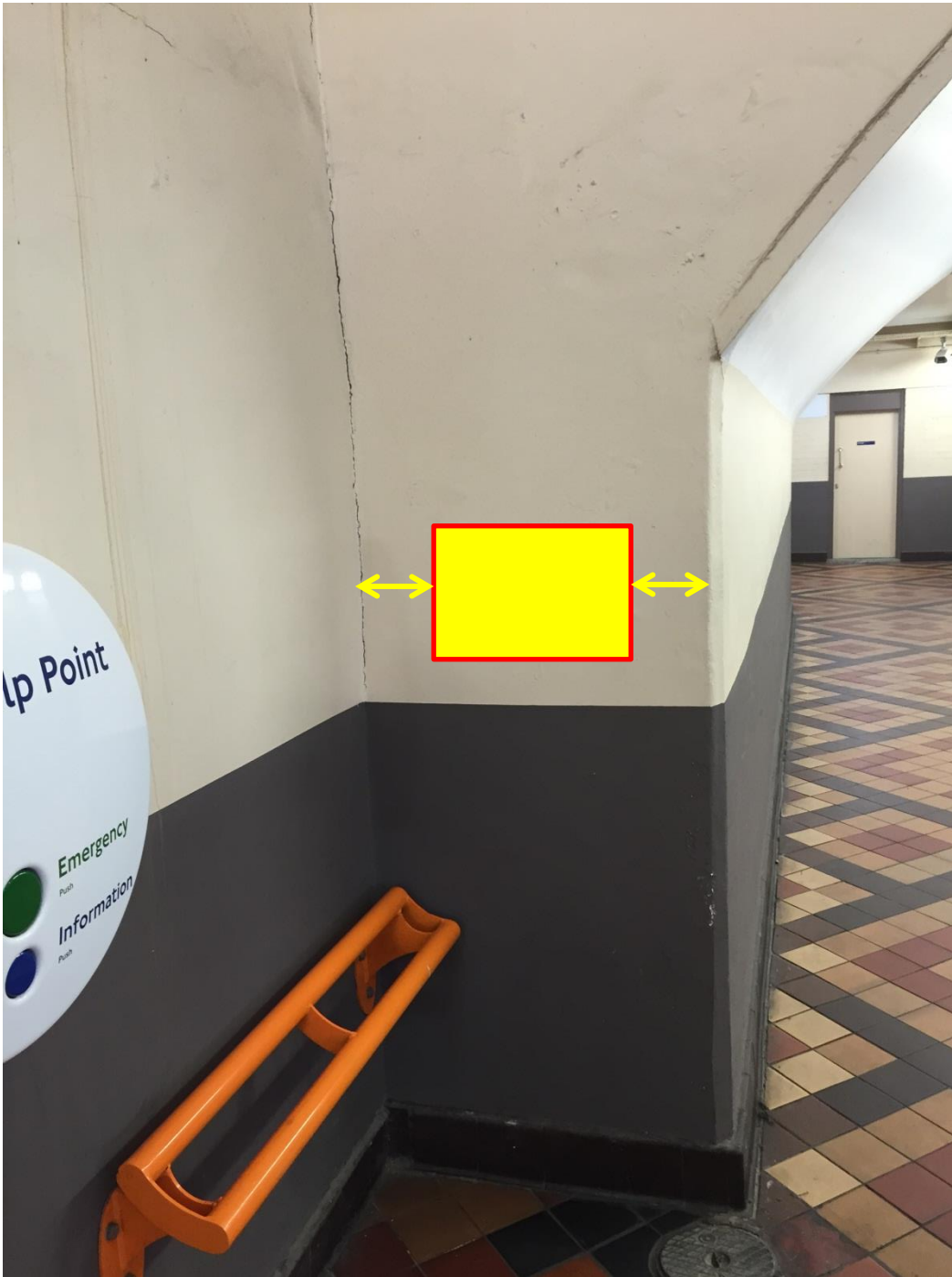
Defibrillator cabinet centred on wall as shown