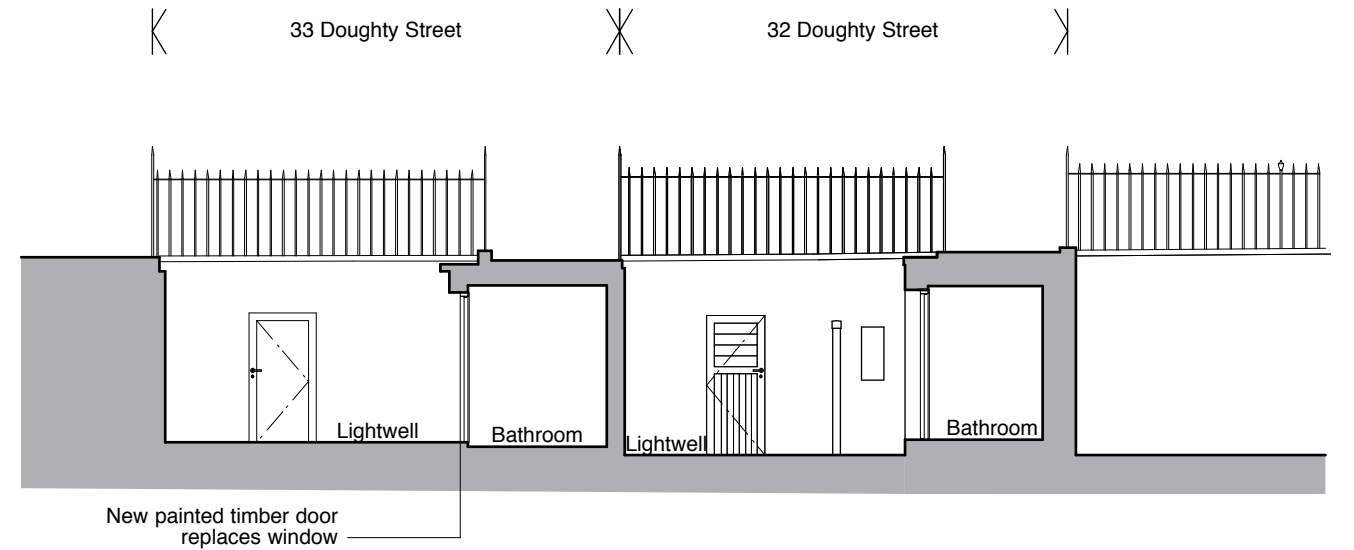
D Proposed Section B - no. 32 - 33