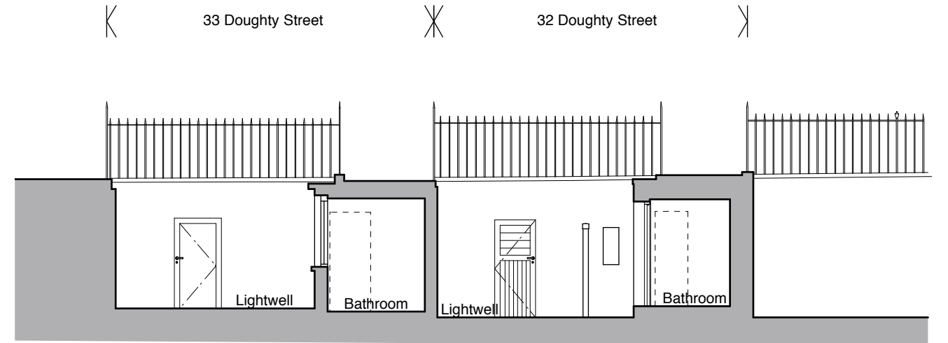
B Existing Section B - no. 32 - 33