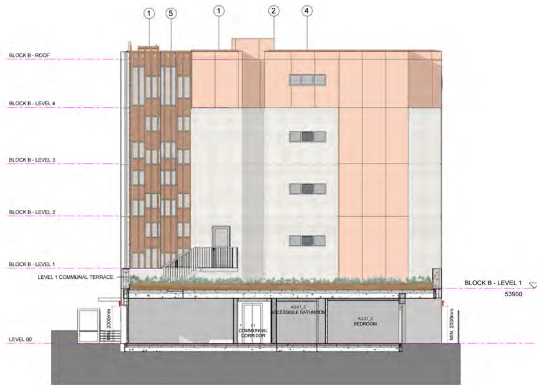
1 BLOCK A - NORTH ELEVATION - PLANNING 1 : 100