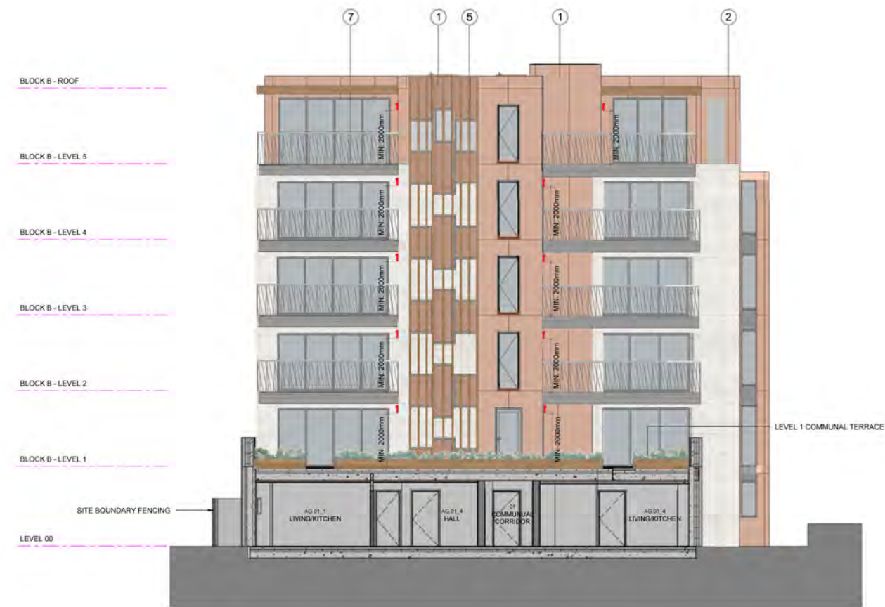
2 BLOCK B - SOUTH ELEVATION - PLANNING 1 : 100