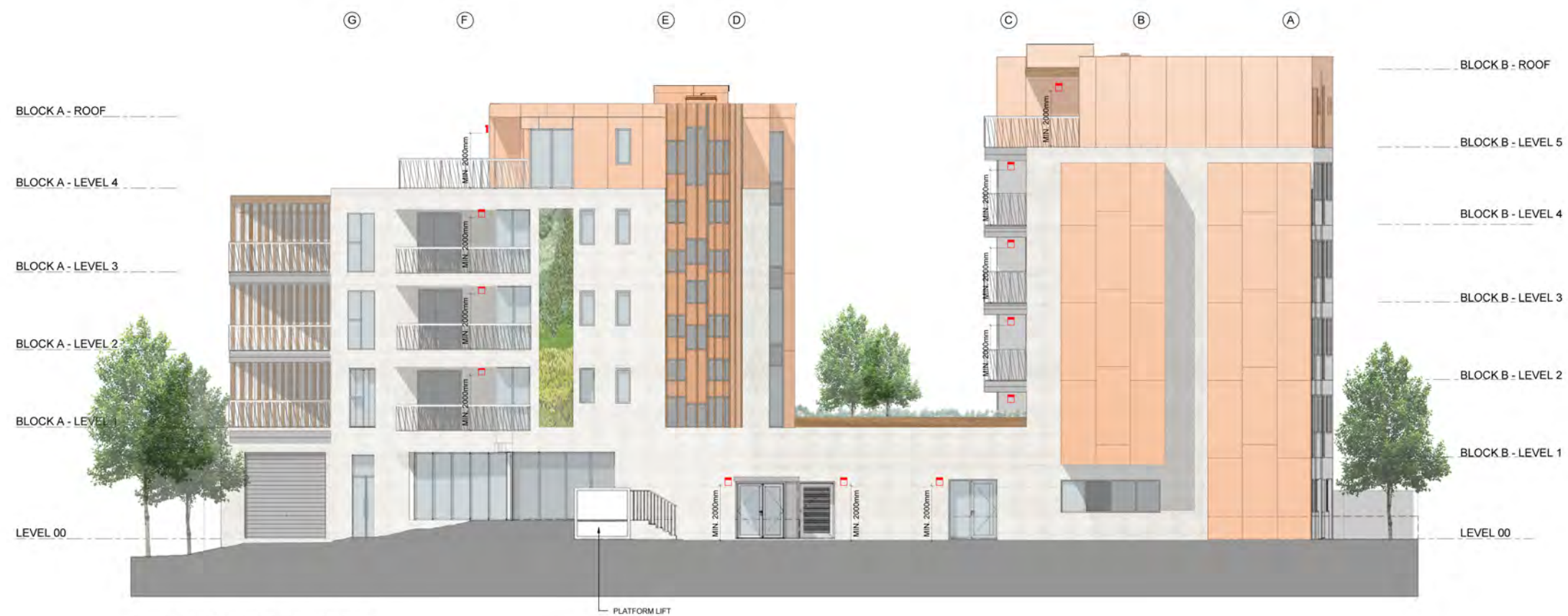
2 EAST ELEVATION - PLANNING 1 : 100