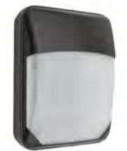
EXTERNAL LIGHT FITTING