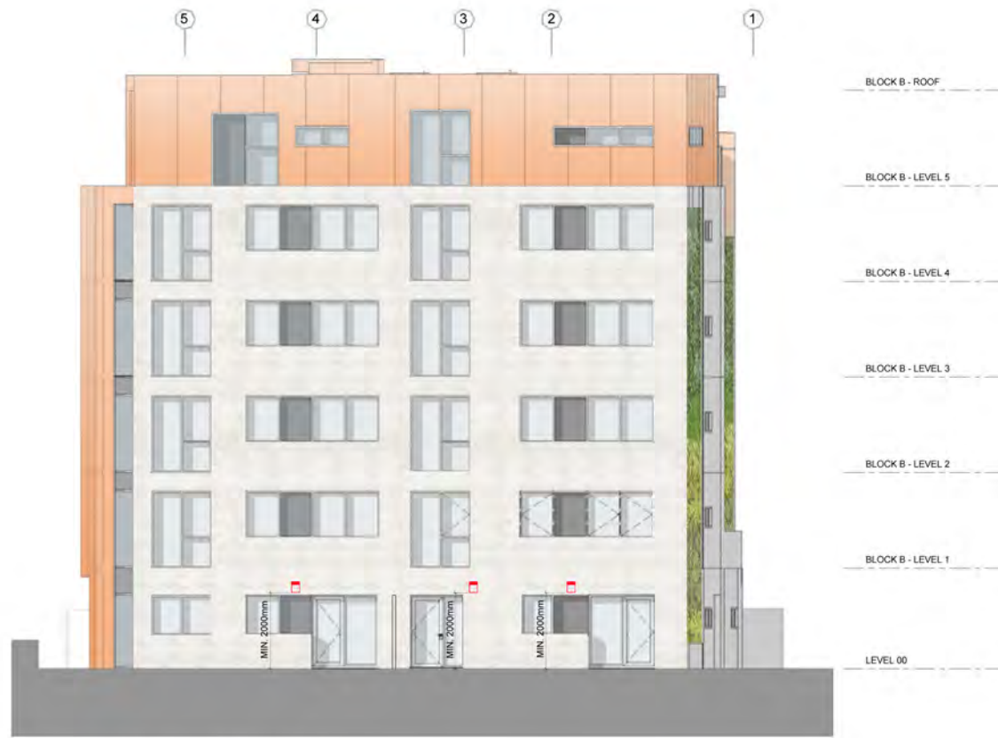
1 NORTH ELEVATION - PLANNING 1 : 100