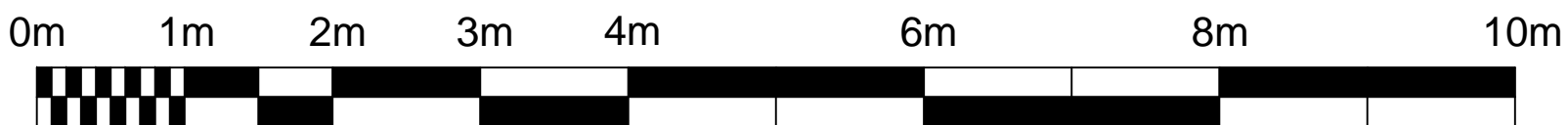
Scale Bar - 1:50