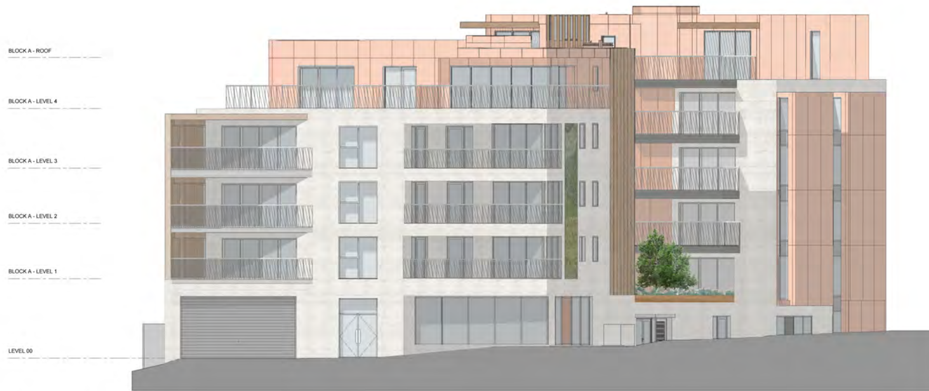
1 SOUTH ELEVATION - PLANNING 1 : 100