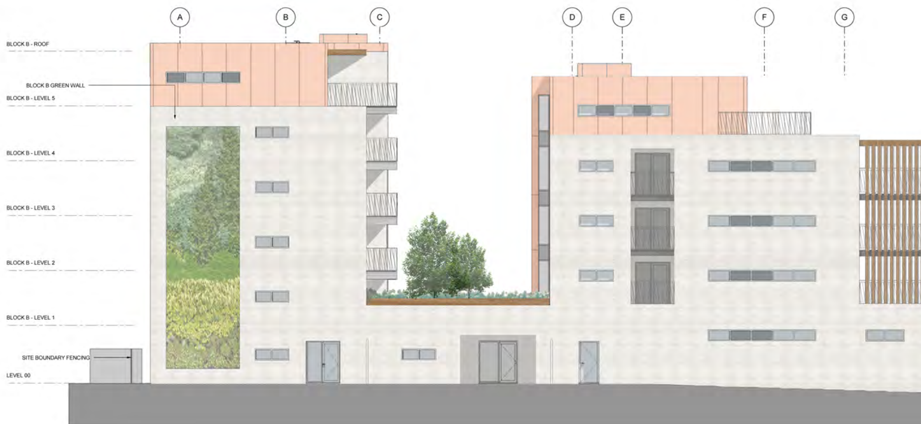
2 WEST ELEVATION - PLANNING 1 : 100

7. 1100mm METAL BALCONY BALUSTRADE WITH BESPOKE STEEL INFILL RAILINGS