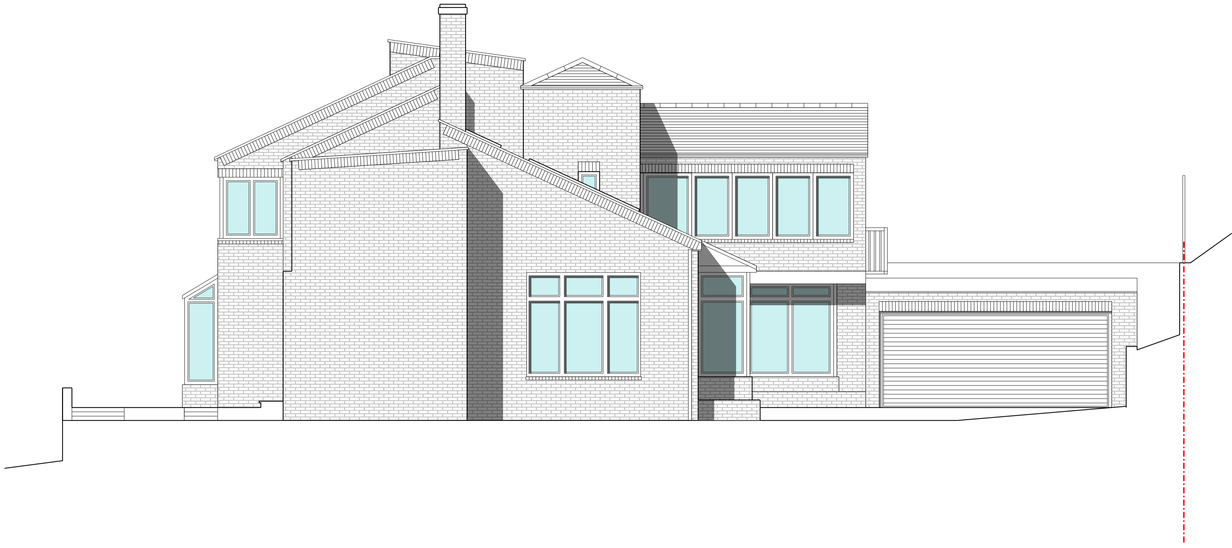
01 SIDE (WEST) ELEVATION AS PROPOSED KAM01_P_132 SCALE 1:50 @ A1

General Notes: Do not scale from this drawing. Use marked dimensions. Should any discrepancies be noted, please inform this office. This drawing is copyright of Matthew Alchurch Architects Limited