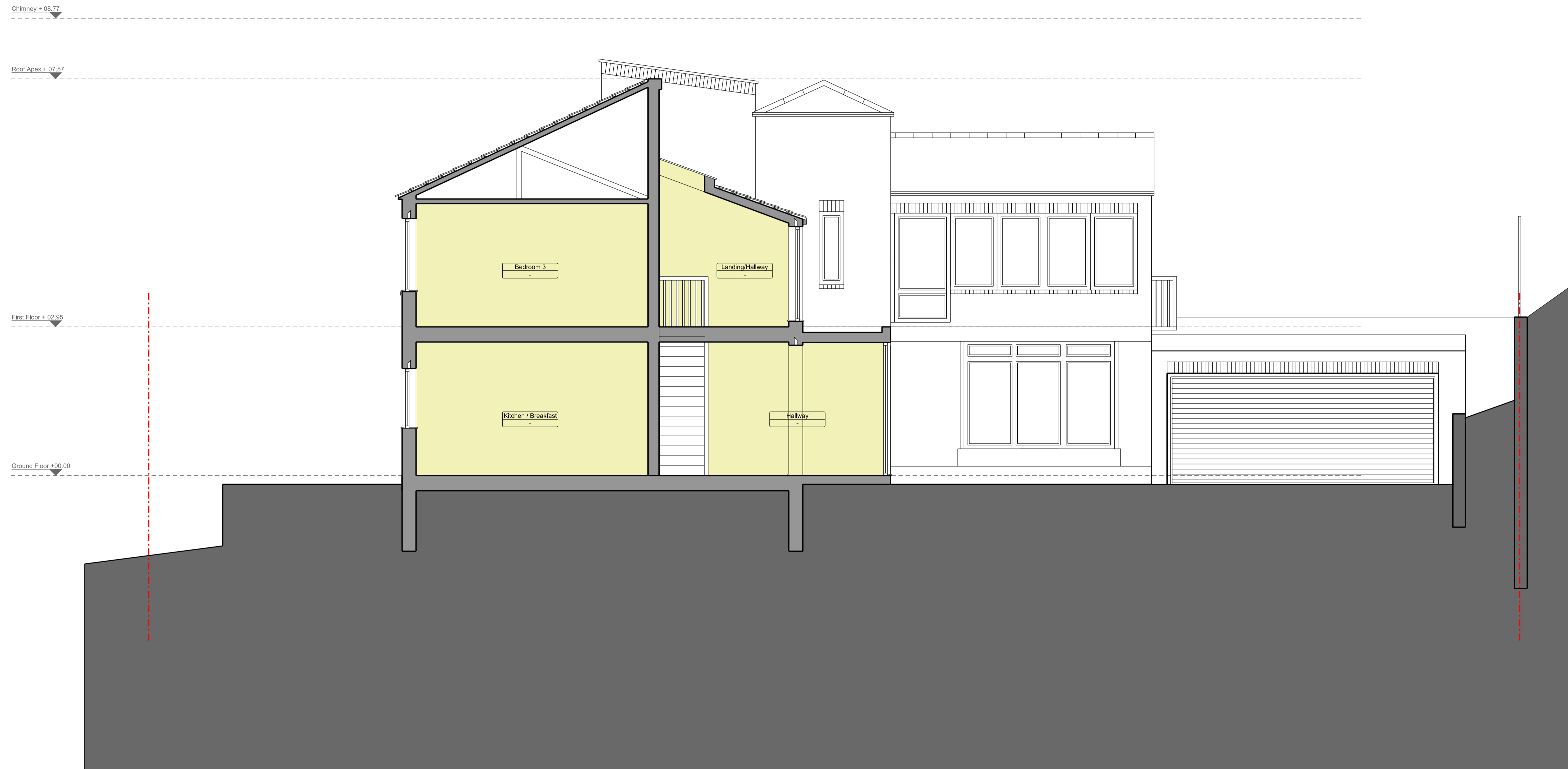
01 PROPOSED SECTION BB KAM01_P_122 SCALE 1:50@A1 / 1:100@A3

General Notes: Do not scale from this drawing. Use marked dimensions. Should any discrepancies be noted, please inform this office. This drawing is copyright of Matthew Allchurch Architects Limited