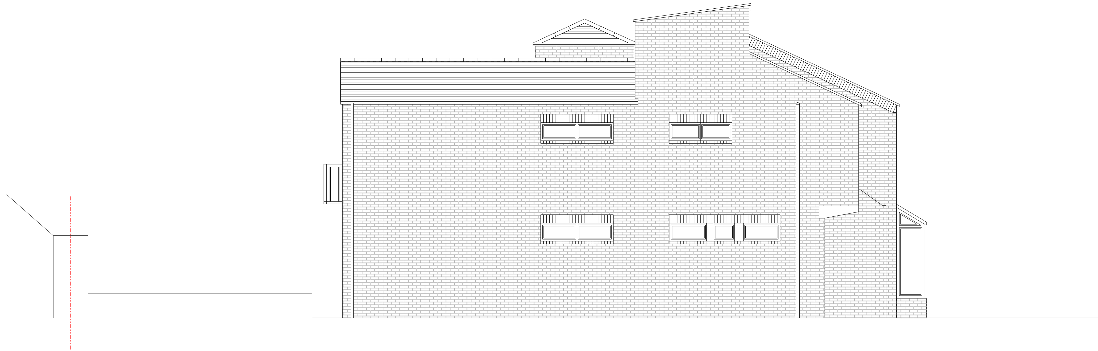
01 SIDE (EAST) ELEVATION AS EXISTING KAM01_P_032 SCALE 1:50 @ A1 / 1:100 @ A3

General Notes: Should any discrepancies be noted, please inform this office. This drawing is copyright of Matthew Allchurch Architects Limited