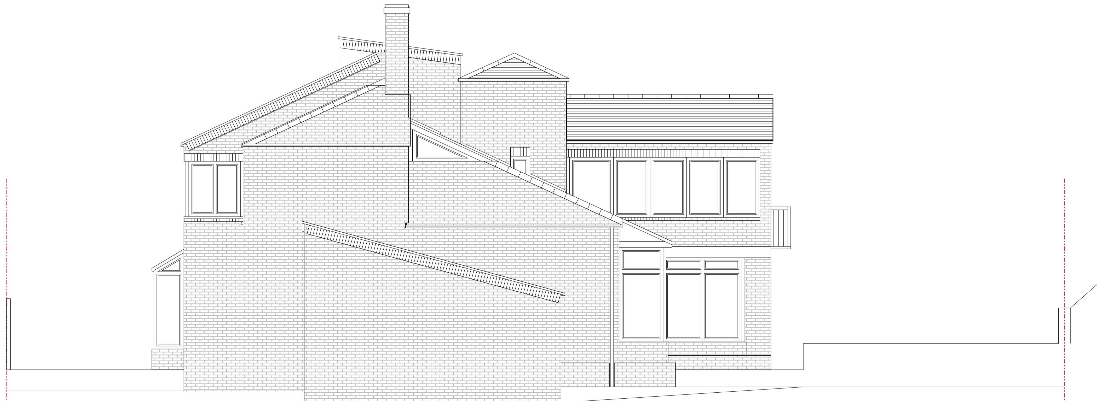
02 SIDE (WEST) ELEVATION AS EXISTING KAM01_P_032 SCALE 1:50 @ A1 / 1:100 @ A3