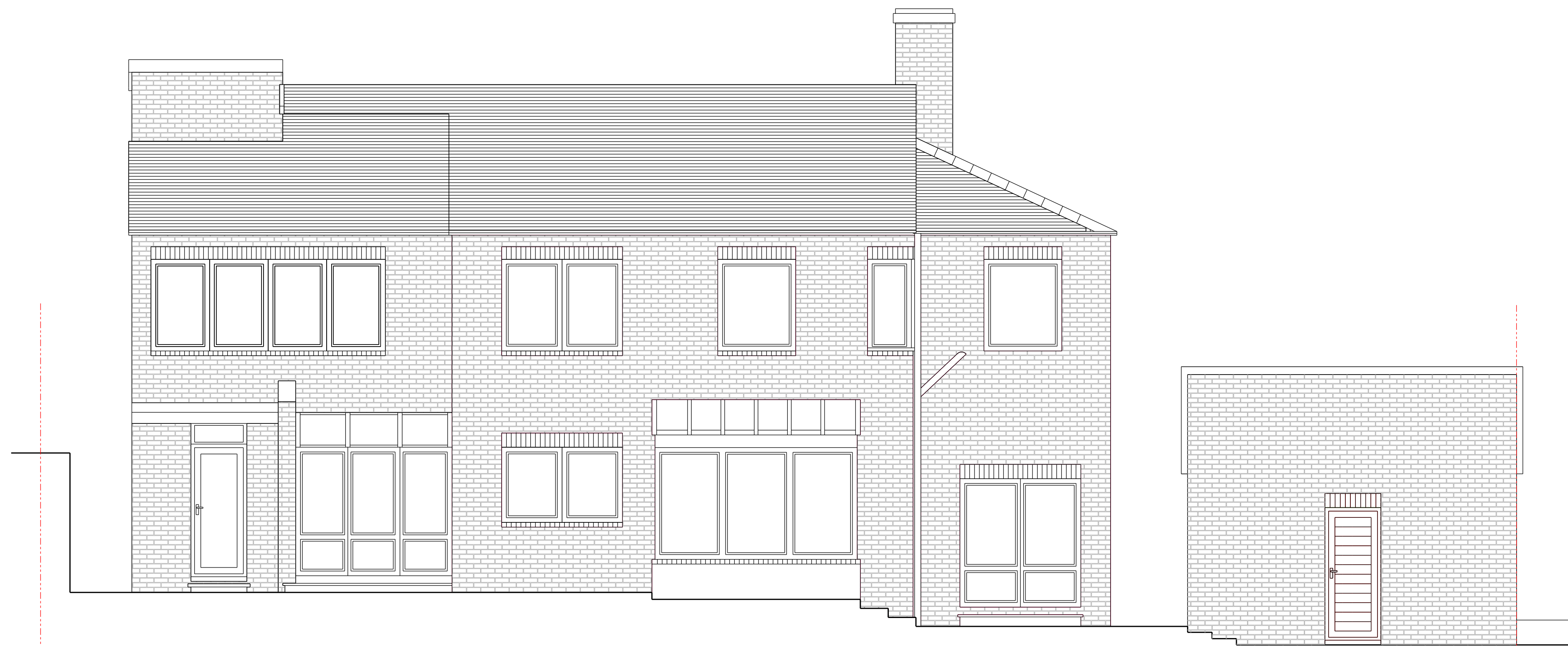
02 REAR (SOUTH) ELEVATION AS EXISTING KAM01_P_032 SCALE 1:50 @ A1 / 1:100 @ A3