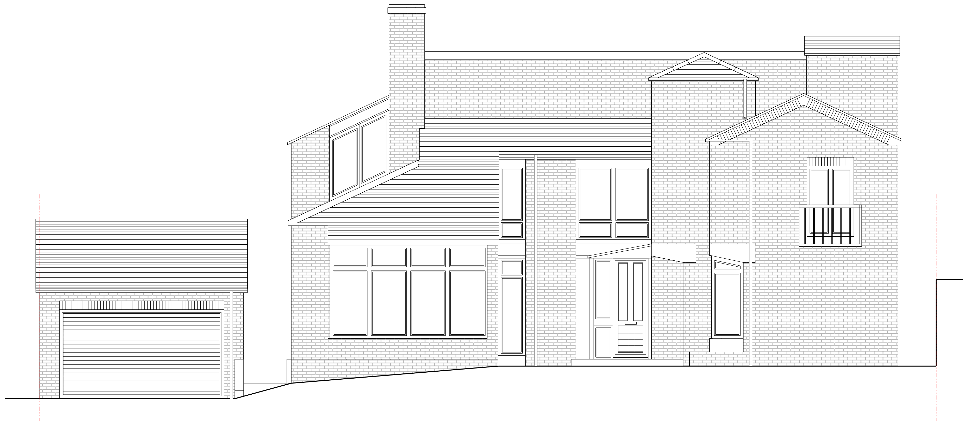
01 FRONT (SOUTH) ELEVATION AS EXISTING KAM01_P_031 SCALE 1:50 @ A1 / 1:100 @ A3

General Notes: Should any discrepancies be noted, please inform this office. This drawing is copyright of Matthew Allchurch Architects Limited