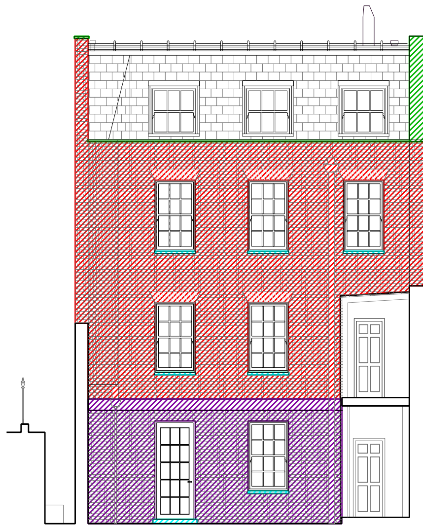
NORTH ELEVATION OF MEWS HOUSE scale 1:100