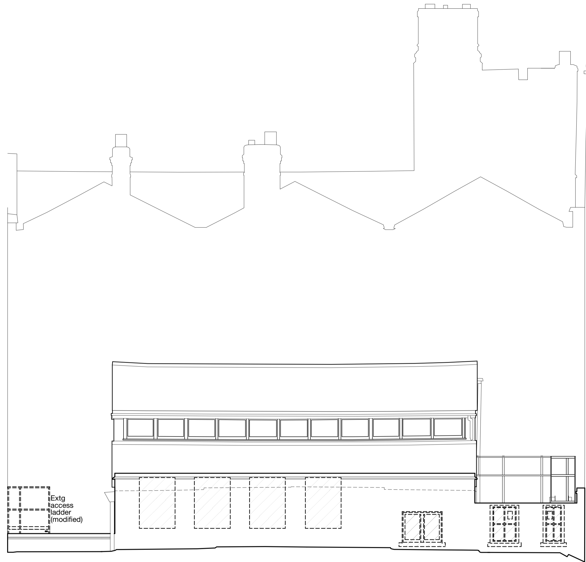
6 South East Elevation