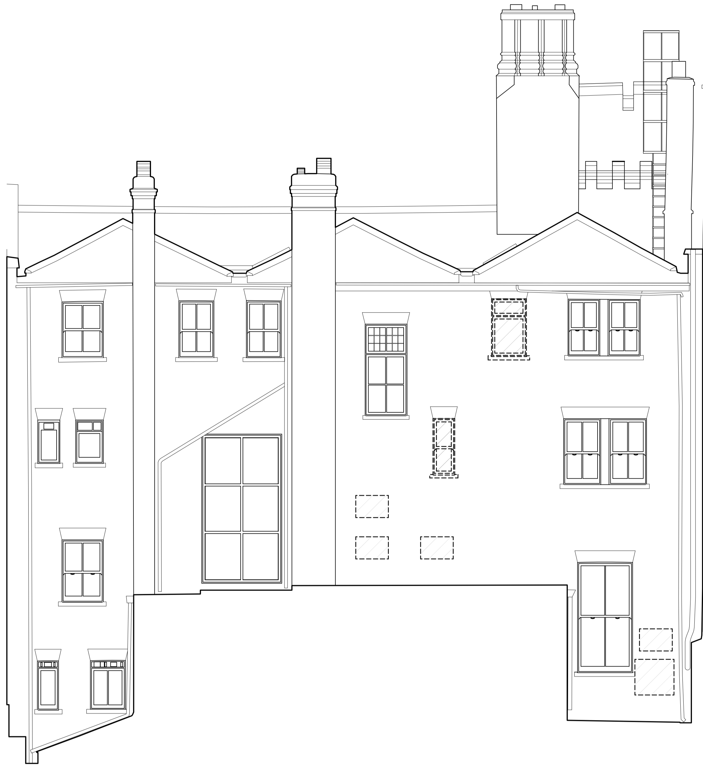
5 South East Elevation