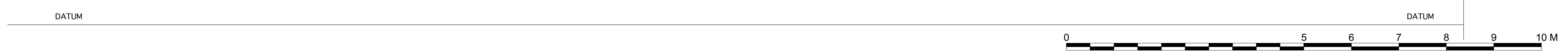
20 North East Elevation (a)

DRAWN DATE PC 08/15 SCALE 1:50 @ A1 JOB NR DRAWING NR ISSUE REV 3769 GA 540 PL 1