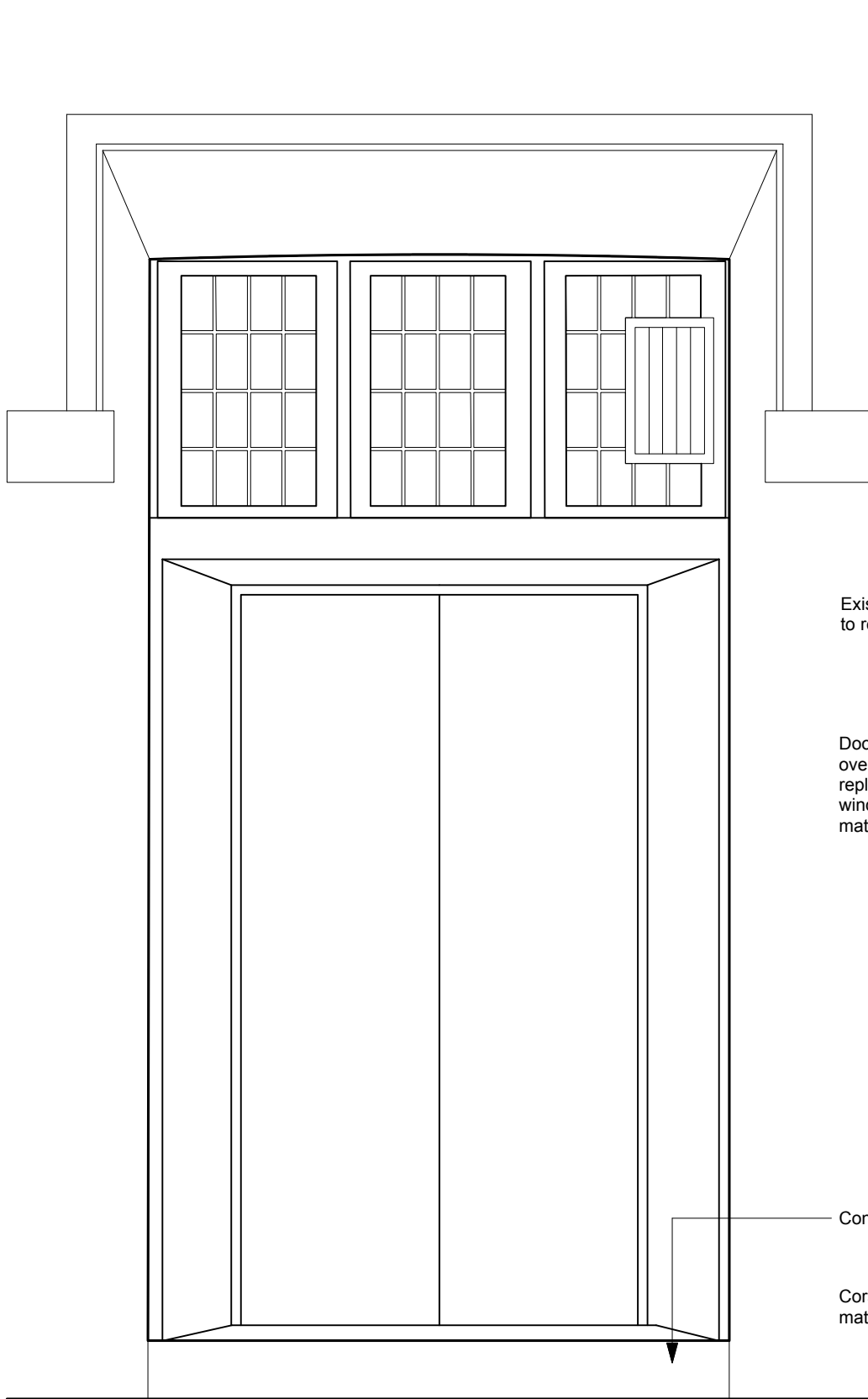
No.16 Chenies Street - Front Elevation - Ground Floor Existing Door 1:20 @ A3